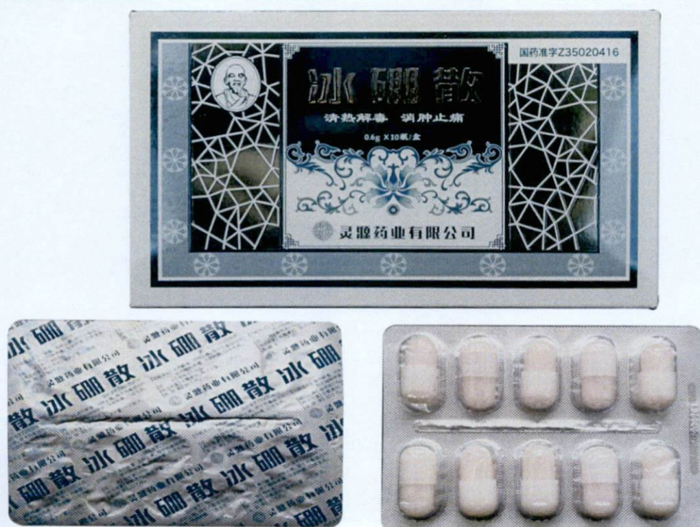
Bing Peng San 0.6g [as reflected in the package insert]