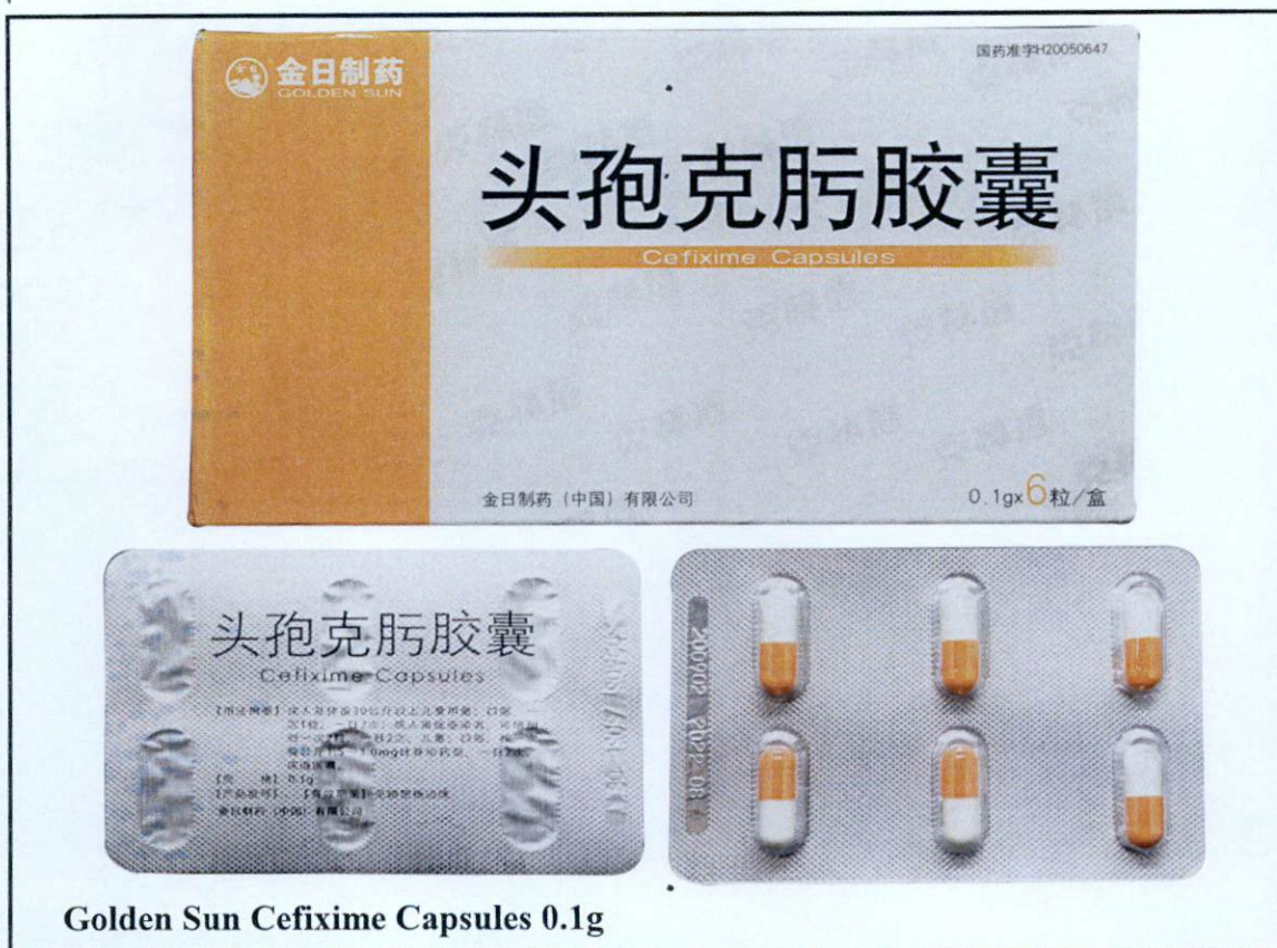
Golden Sun Cefixime Capsules 0.1g