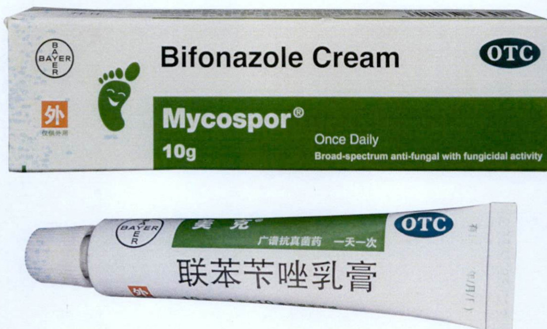
OTC Bayer Bifonazole Cream (Mycospor®) 10g