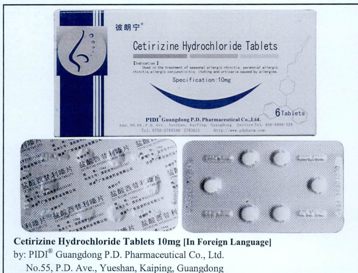
Cetirizine Hydrochloride Tablets 10mg [In Foreign Language]