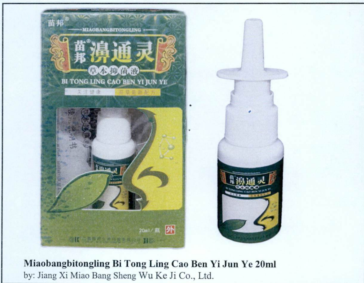
Miaobangbitongling Bi Tong Ling Cao Ben Yi Jun Ye 20ml by: Jiang Xi Miao Bang Sheng Wu Ke Ji Co., Ltd.

The Food and Drug Administration (FDA) advises the public against the purchase and use of the following unregistered drug products: