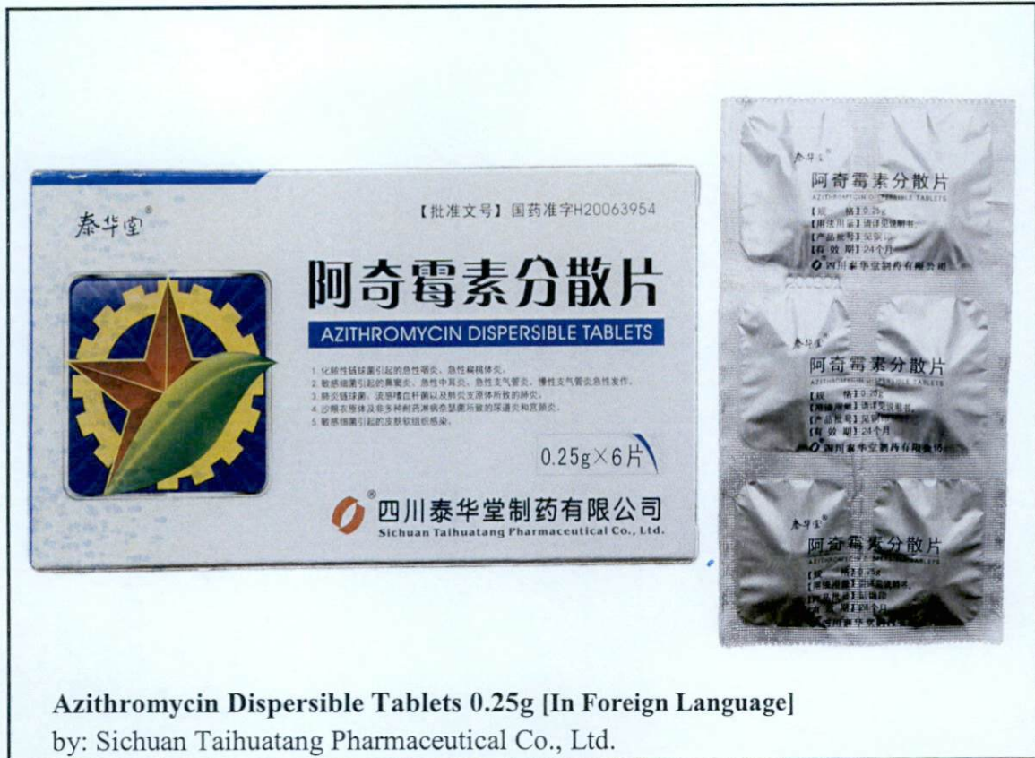
Azithromycin Dispersible Tablets 0.25g [In Foreign Language] by: Sichuan Taihuatang Pharmaceutical Co., Ltd.