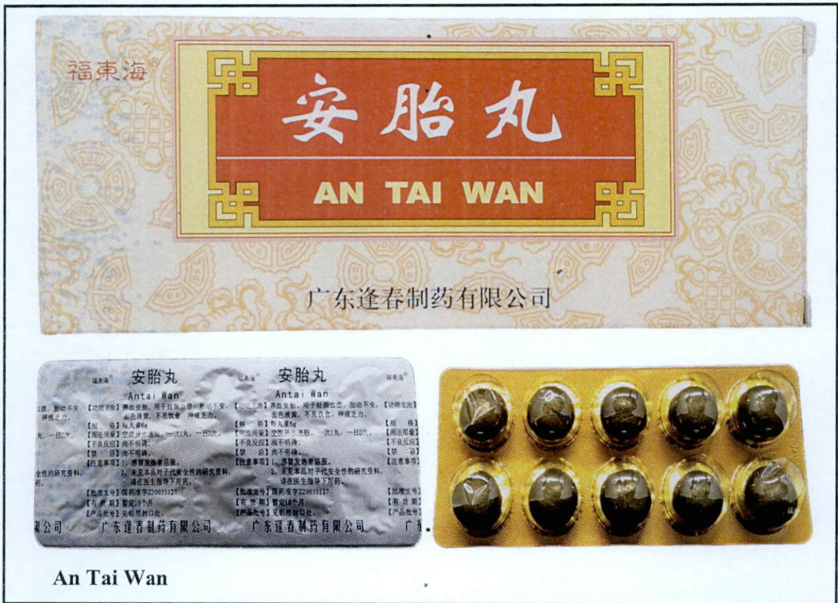
An Tai Wan