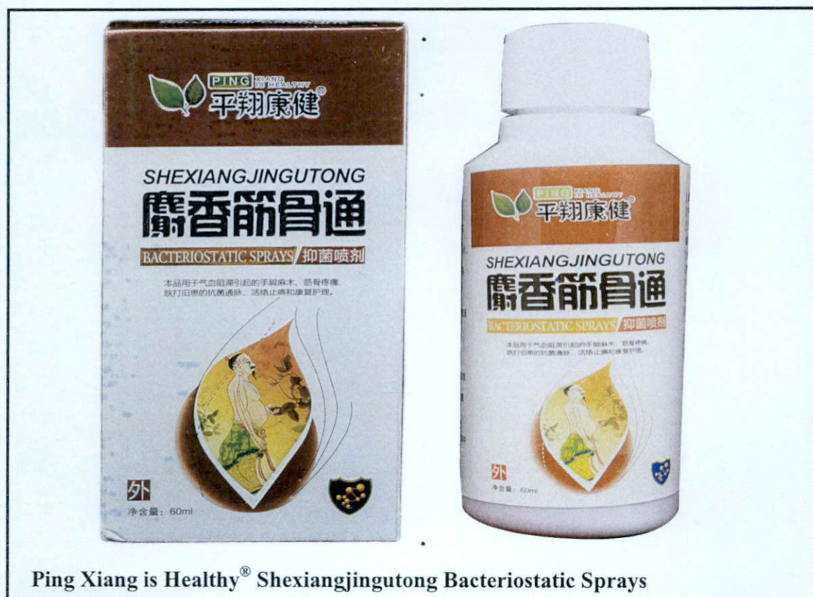
Ping Xiang is Healthy® Shexiangjingtong Bacteriostatic Sprays