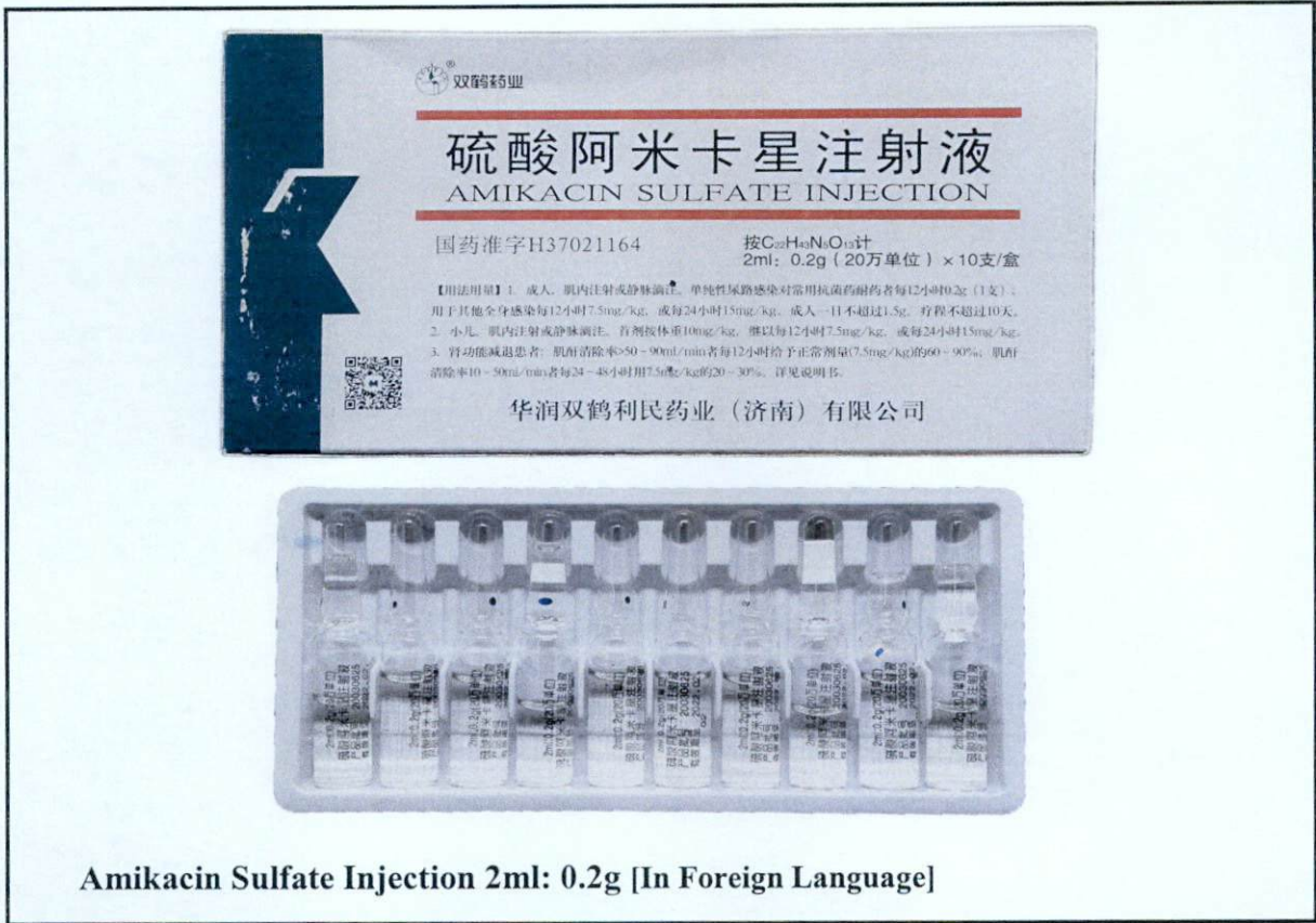
Amikacin Sulfate Injection 2ml: 0.2g [In Foreign Language]