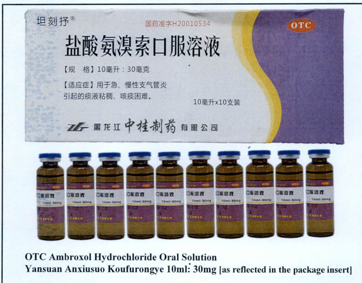
OTC Ambroxol Hydrochloride Oral Solution Yansuan Anxiusuo Koufurongye 10ml: 30mg [as reflected in the package insert]

The Food and Drug Administration (FDA) advises the public against the purchase and use of the following unregistered drug products: