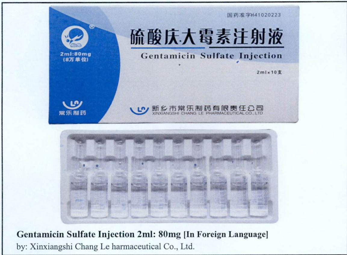
Gentamicin Sulfate Injection 2ml: 80mg [In Foreign Language] by: Xinxiangshi Chang Le pharmaceutical Co., Ltd.