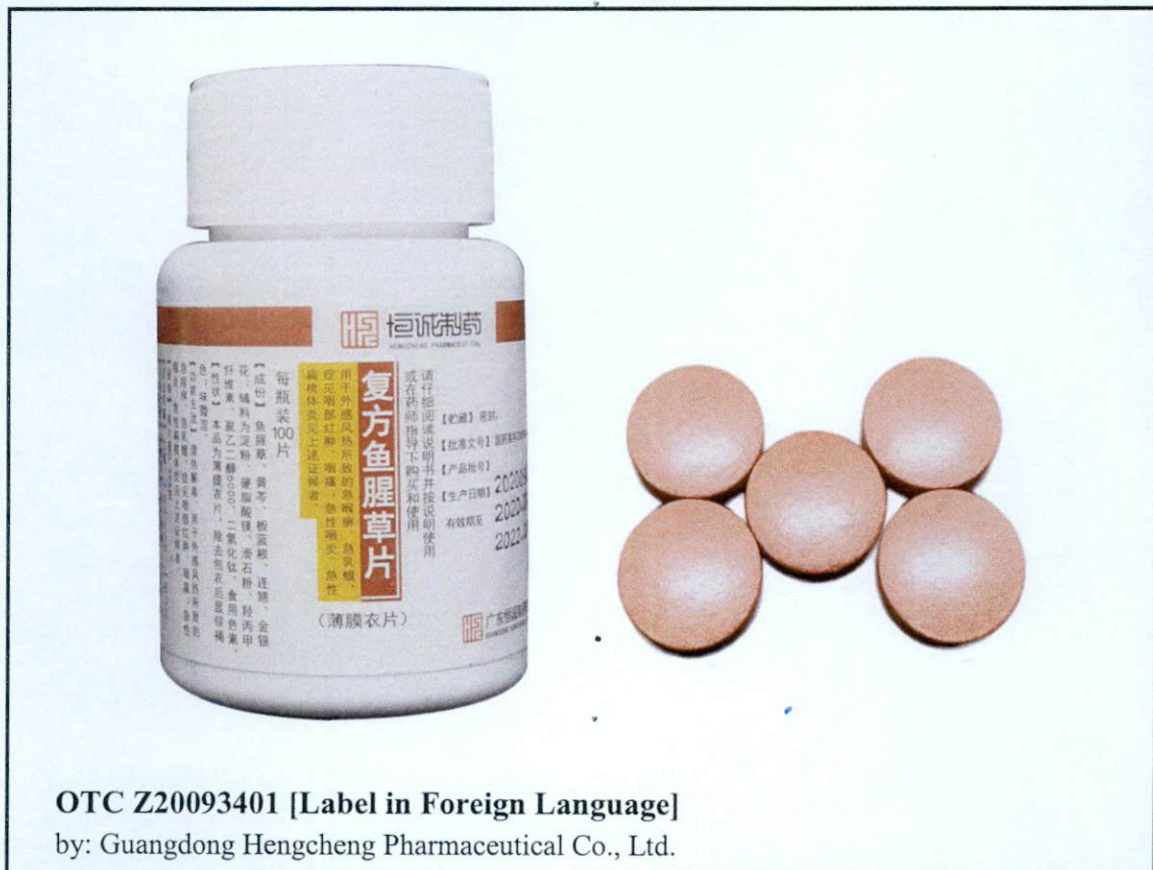
OTC Z20093401 [Label in Foreign Language] by: Guangdong Hengcheng Pharmaceutical Co., Ltd.