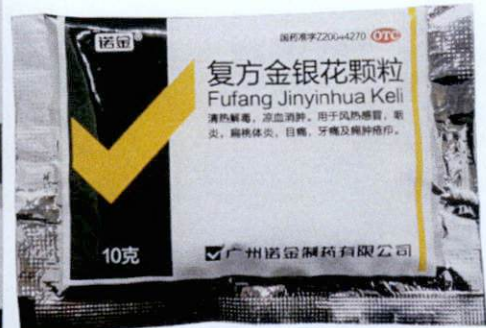
OTC Fufang Jinyinhua Keli