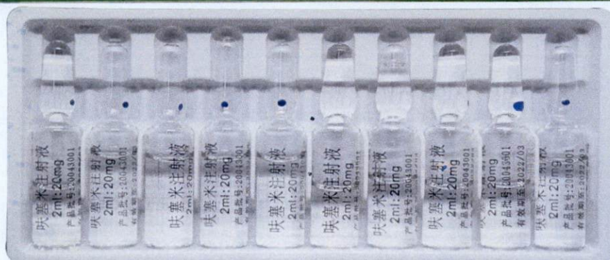
Furosemide Injection 2ml: 20mg [In Foreign Language]