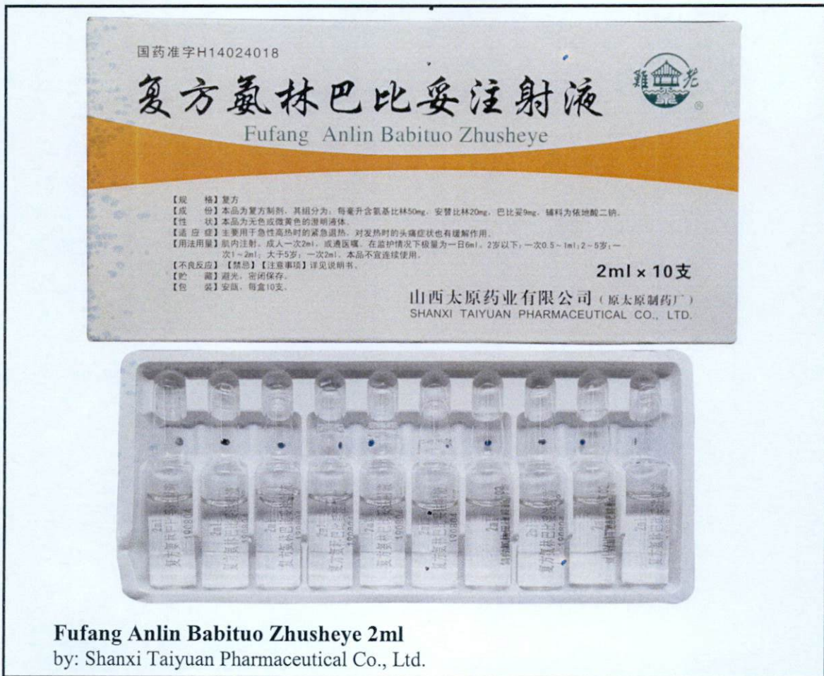
Fufang Anlin Babituo Zhusheye 2ml by: Shanxi Taiyuan Pharmaceutical Co., Ltd.

The Food and Drug Administration (FDA) advises the public against the purchase and use of the following unregistered drug products: