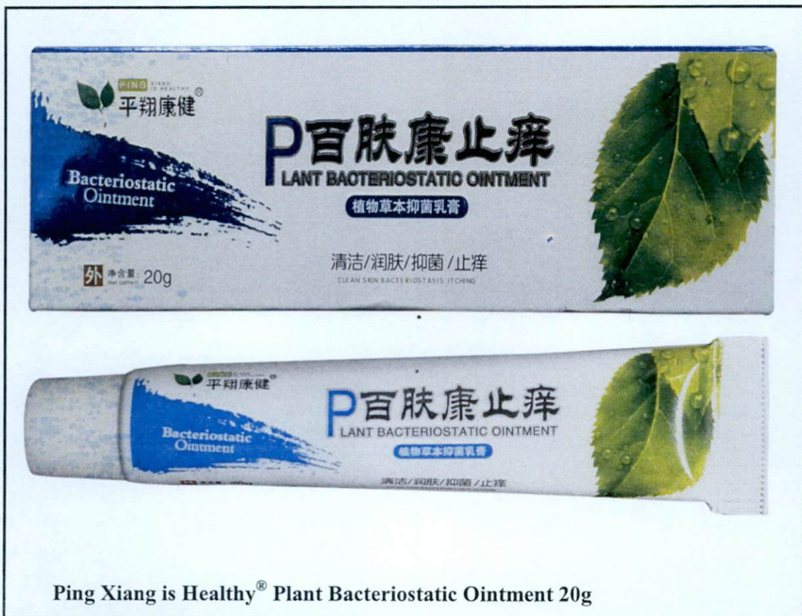
Ping Xiang is Healthy® Plant Bacteriostatic Ointment 20g

The Food and Drug Administration (FDA) advises the public against the purchase and use of the following unregistered drug products: