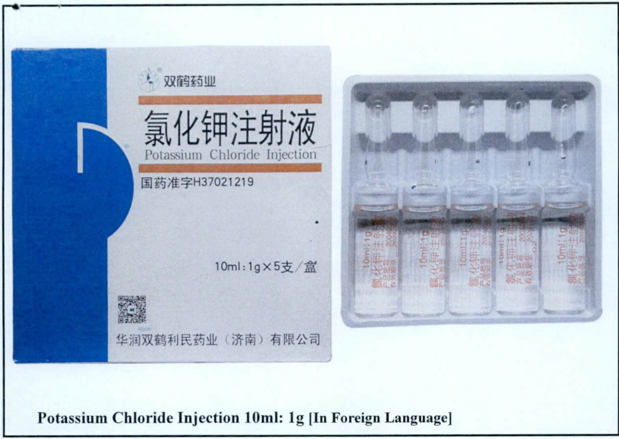
Potassium Chloride Injection 10ml: 1g [In Foreign Language]