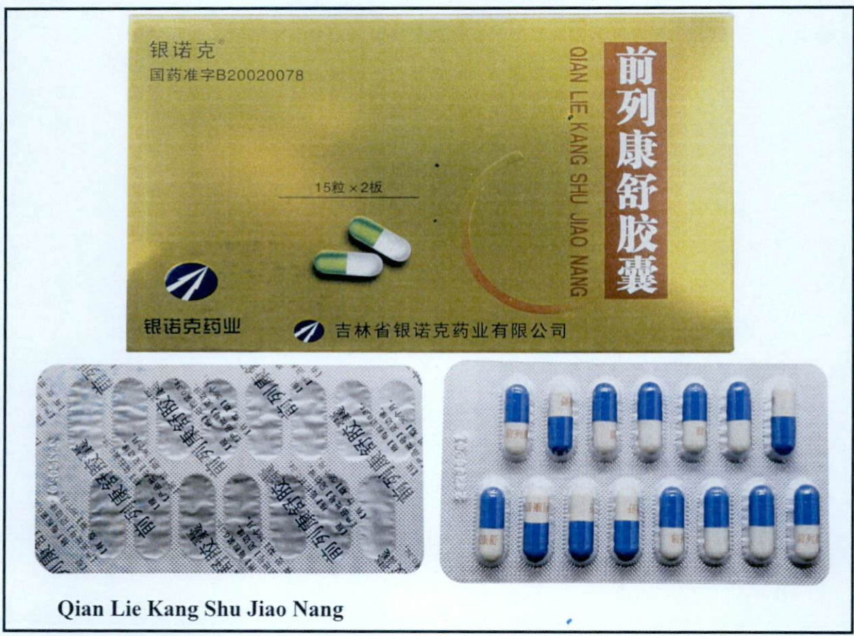
Qian Lie Kang Shu Jiao Nang