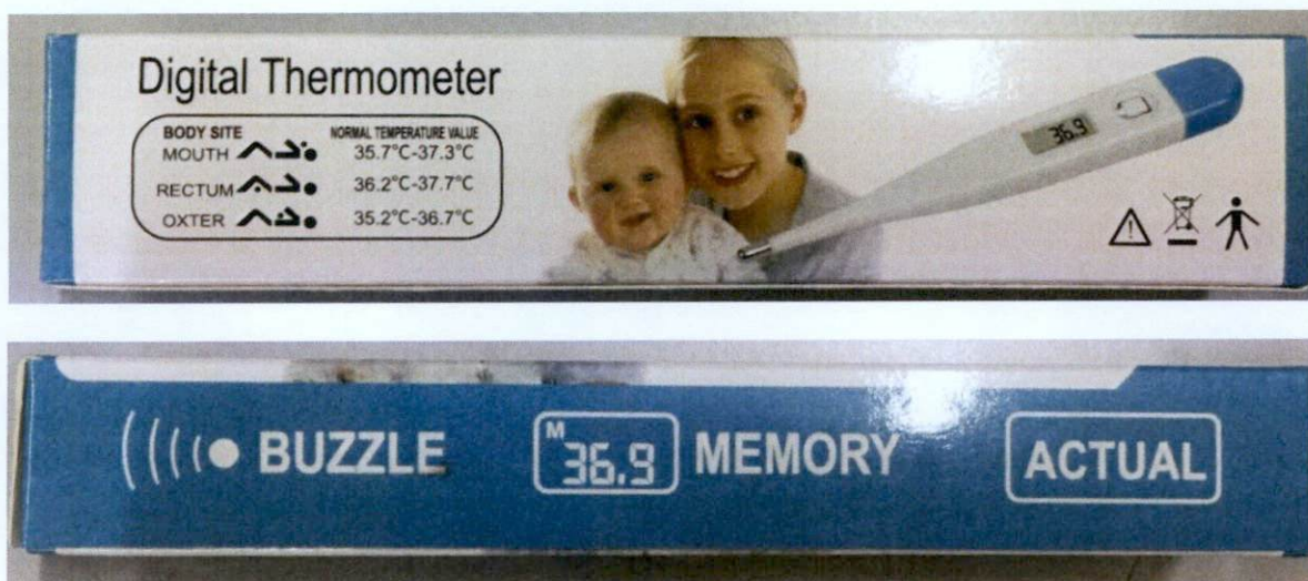
Figure 1. Unregistered Digital Thermometer

The Food and Drug Administration (FDA) warns all healthcare professionals and the general public NOT TO PURCHASE AND USE the unregistered medical device product: