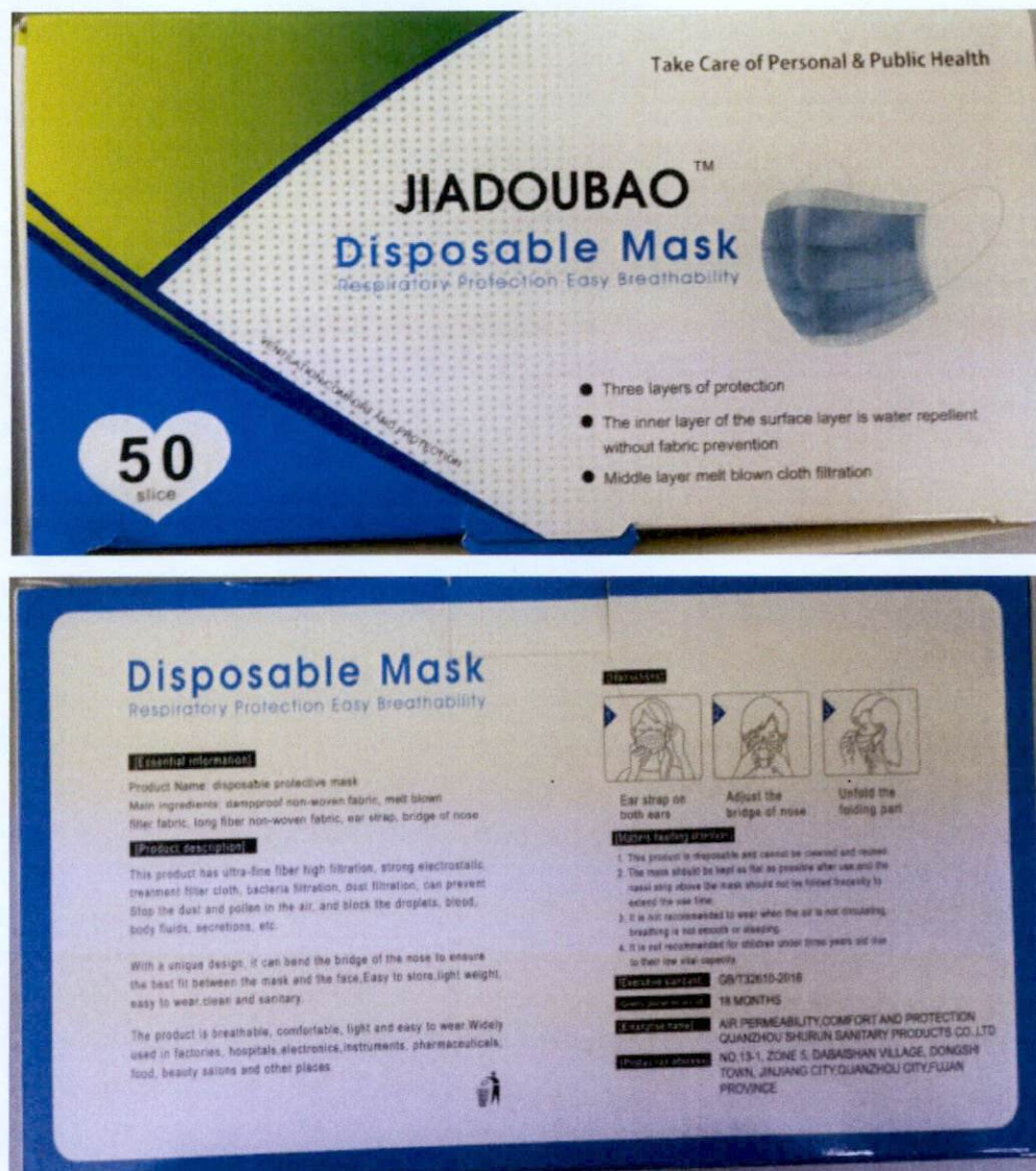
Figure 1. Unnotified Jiadoubao™ Disposable Mask

The Food and Drug Administration (FDA) warns all healthcare professionals and the general public NOT TO PURCHASE AND USE the unnotified medical device product: