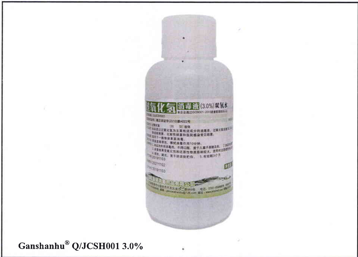
Figure 3. Unregistered drug product