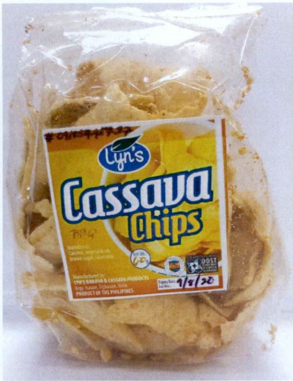
Figure 2. Unregistered LYN'S Cassava Chips BBQ, 60g