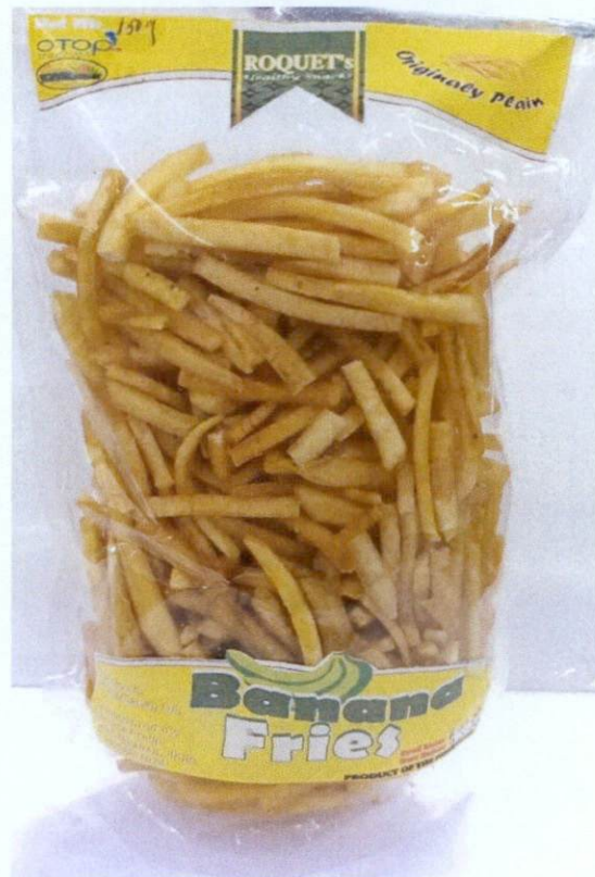
Figure 1. Unregistered ROQUET'S Banana Fries, 150g

The Food and Drug Administration (FDA) warns all healthcare professionals and the general public NOT TO PURCHASE AND CONSUME the following unregistered food products: