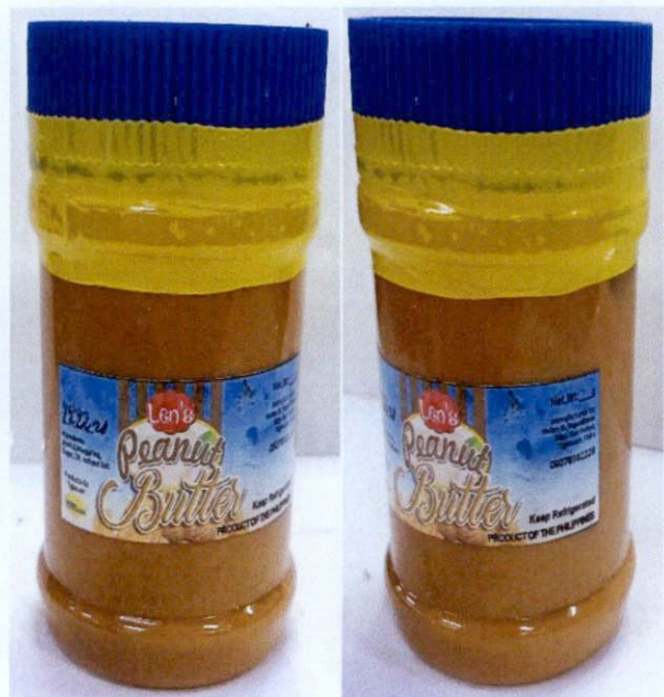
Figure 5. Unregistered LEN'S Peanut Butter