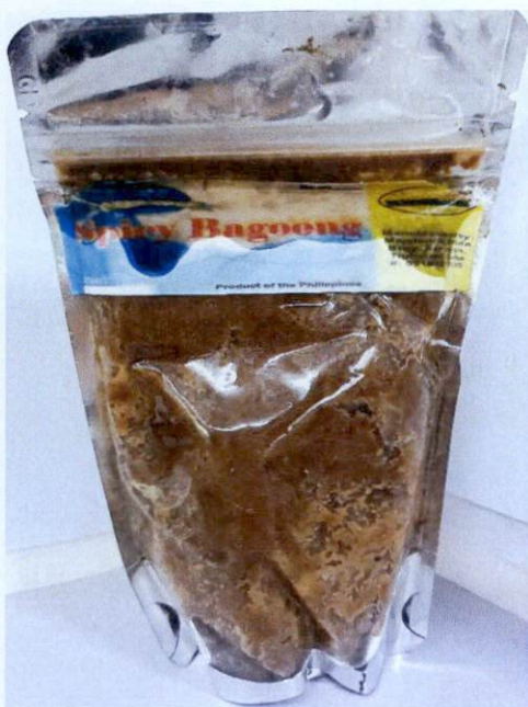
Figure 4. Unregistered ATABAYAN LIVELIHOOD PRODUCTS Spicy Bagoong