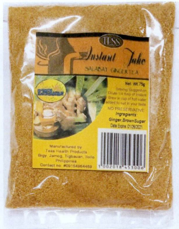
Figure 3. Unregistered TESS Instant Taho, Salabat Ginger Tea, 75g