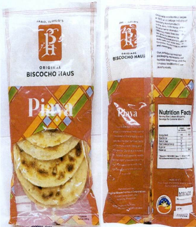
Figure 2. Unregistered ORIGINAL BISCOCHO HAUS Piaya, 7 pieces,