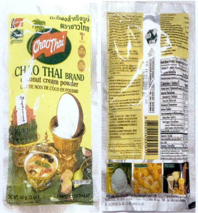
Figure 3. Unregistered CHAO THAI BRAND Coconut Cream Powder, 60g