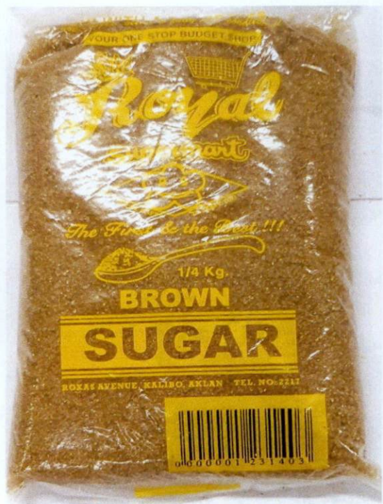
Figure 5. Unregistered ROYAL SUPERMART Brown Sugar 1/4 kg