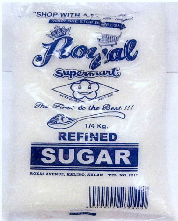
Figure 4. Unregistered ROYAL SUPERMART Refined Sugar 1/4 kg