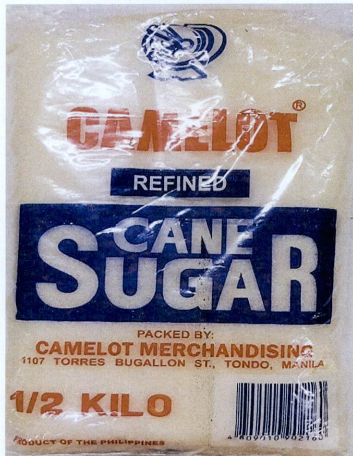
Figure 1. Unregistered CAMELOT Refined Cane Sugar, 1/2 Kilo

The Food and Drug Administration (FDA) warns all healthcare professionals and the general public NOT TO PURCHASE AND CONSUME the following unregistered food products: