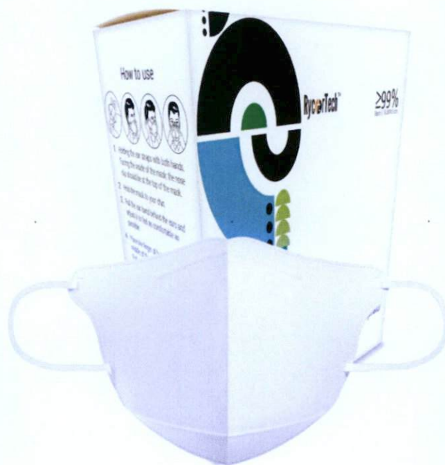
Figure 3. Unnotified RycorTech™ KN95 Masterclass White 5ply Surgical Disposable Respirator