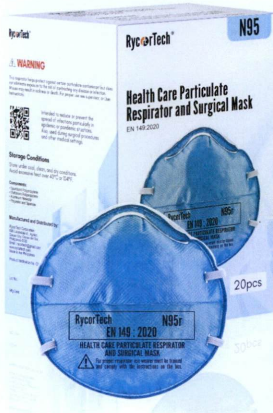
Figure 5. Unnotified RycorTech™ N95 Health Care Particulate Respirator and Surgical Mask