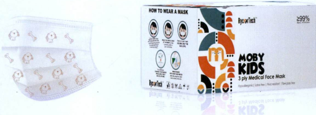
Figure 1. Unnotified RycorTech™ Moby Kids 3ply Medical Face Mask

The Food and Drug Administration (FDA) warns all healthcare professionals and the general public NOT TO PURCHASE AND USE the unnotified medical device products: