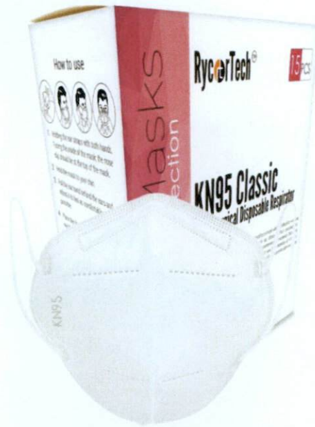
Figure 4. Unnotified RycorTech™ KN95 Classic White 5ply Surgical Disposable Respirator