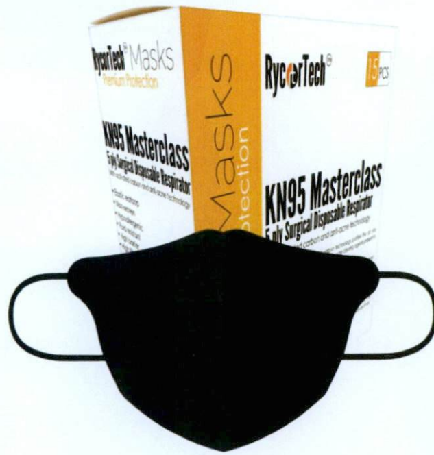
Figure 2. Unnotified RycorTech™ KN95 Masterclass 5ply Surgical Disposable Respirator