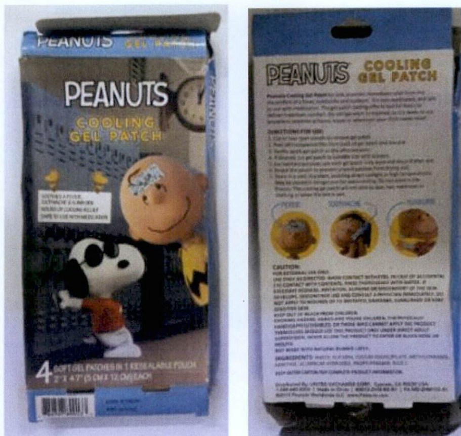
Figure 1. Unnotified Peanuts Cooling Gel Patch

The Food and Drug Administration (FDA) warns all healthcare professionals and the general public NOT TO PURCHASE AND USE the unnotified medical device products: