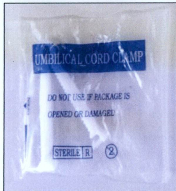
Figure 1. Unnotified Umbilical Cord Clamp