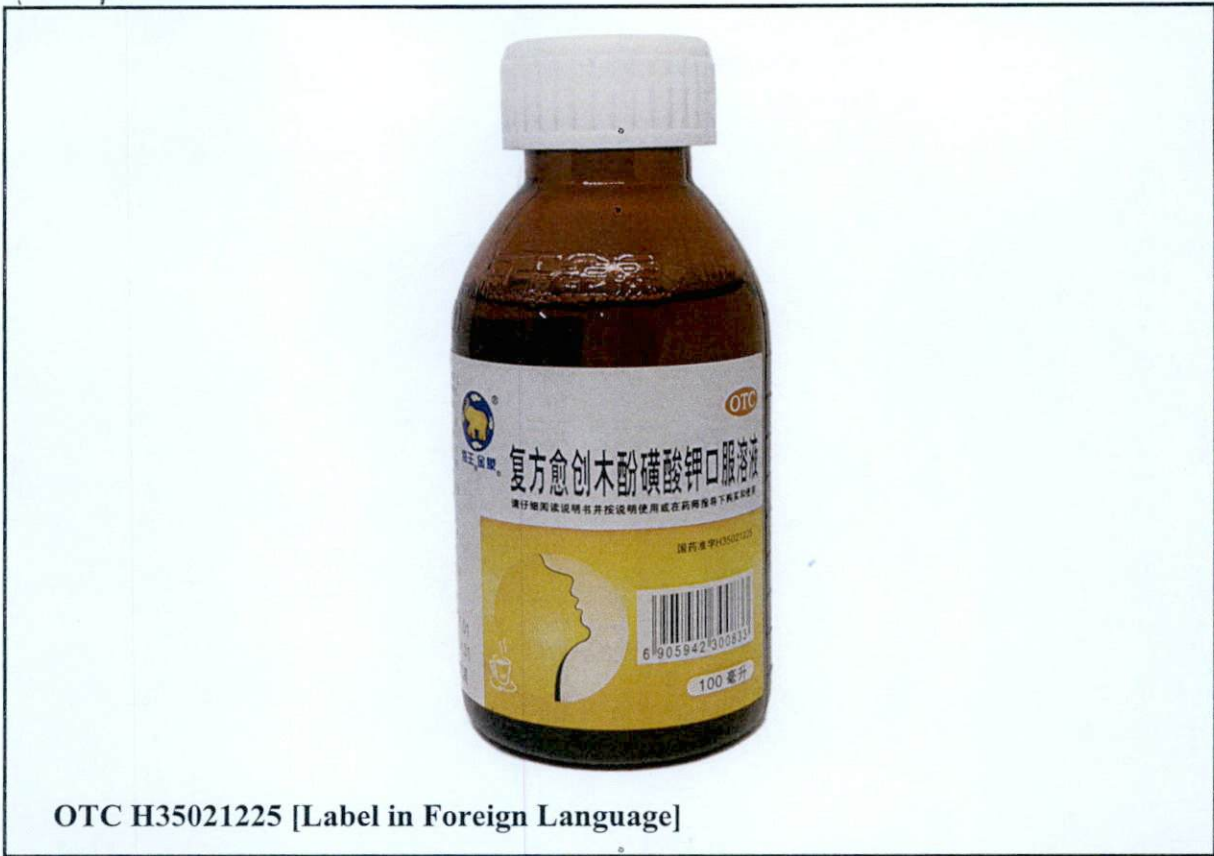
OTC H35021225 [Label in Foreign Language]