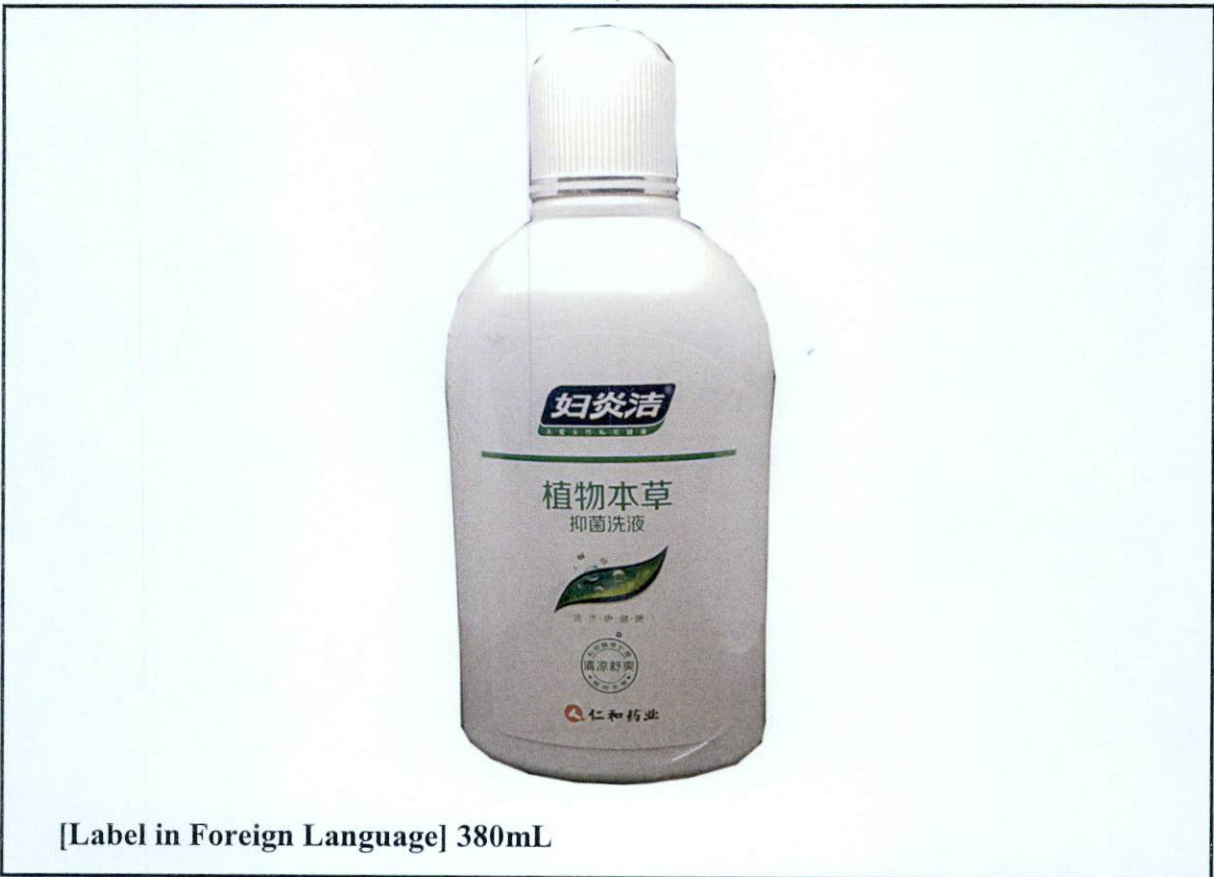
[Label in Foreign Language] 380mL