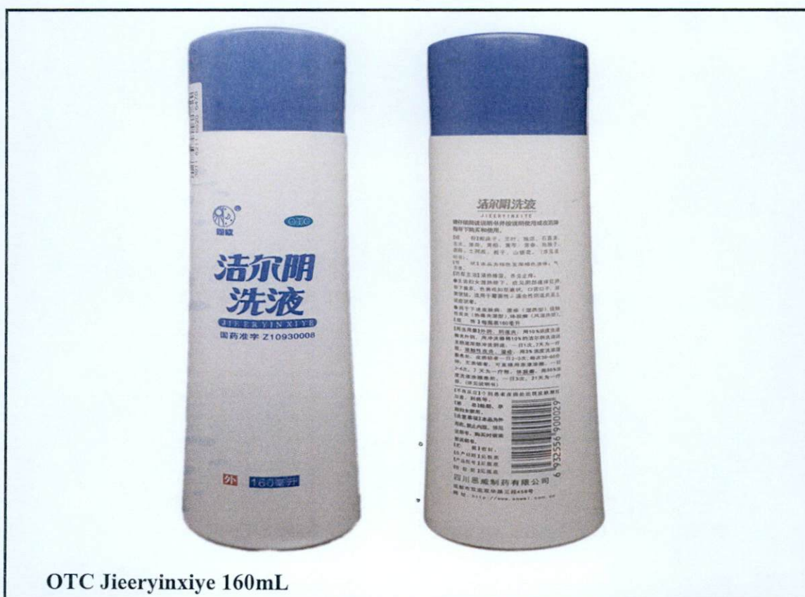
OTC Jieryinxiye 160mL