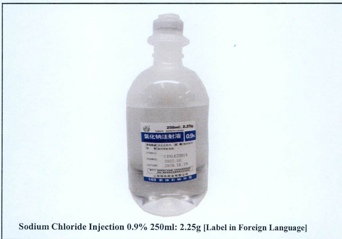
Sodium Chloride Injection 0.9% 250ml: 2.25g [Label in Foreign Language]

The Food and Drug Administration (FDA) advises the public against the purchase and use of the following unregistered drug products: