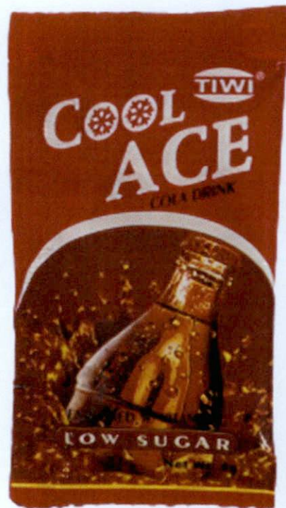
Figure 5. Unregistered TIWI Cool Ace Cola Enriched with Vitamin C Low Sugar, 4 g