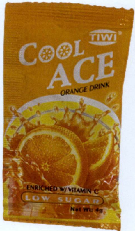
Figure 3. Unregistered TIWI Cool Ace Orange Drink Enriched with Vitamin C Low Sugar, 4 g