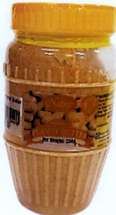
Figure 1. Unregistered NATING'S Homemade Peanut Butter, 250 g

The Food and Drug Administration (FDA) warns all healthcare professionals and the general public NOT TO PURCHASE AND CONSUME the following unregistered food products: