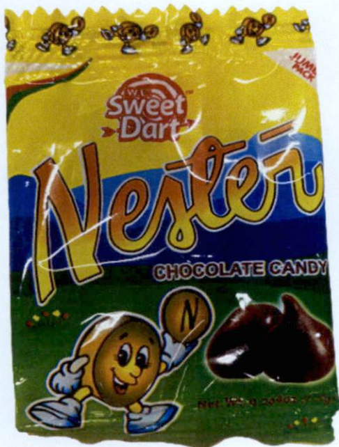
Figure 4. Unregistered SWEET DART Nester Chocolate Candy, 7.5 g