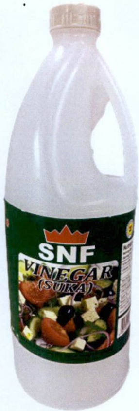
Figure 2. Unregistered SNF Vinegar, 1 L