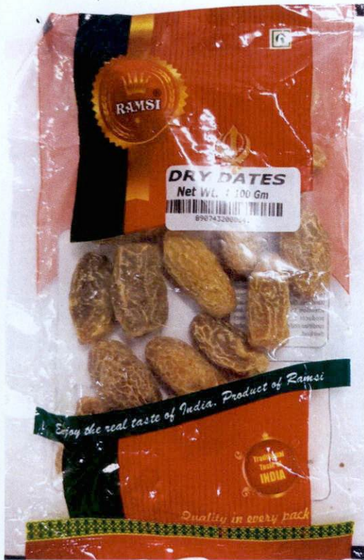
Figure 2. Unregistered RAMSI Dry Dates, 100 g