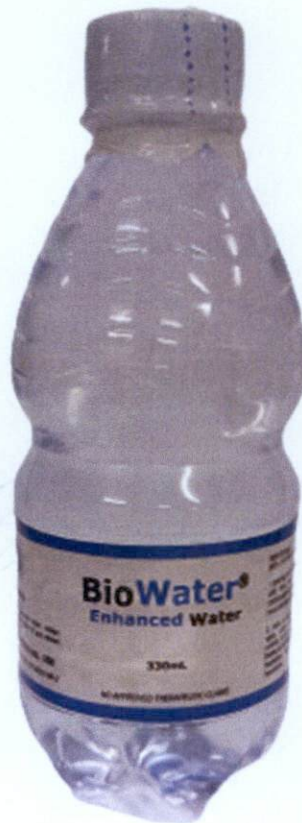
Figure 1. Unregistered BIOWATER Enhanced Water, 330 ml

The Food and Drug Administration (FDA) warns all healthcare professionals and the general public NOT TO PURCHASE AND CONSUME the following unregistered food products: