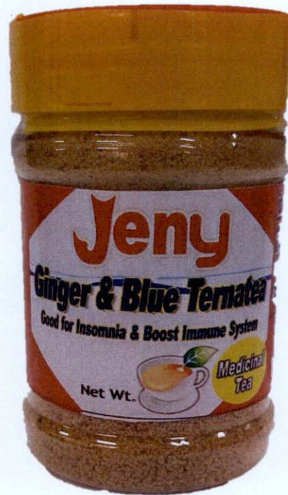
Figure 3. Unregistered JENY Ginger & Blue Ternatea