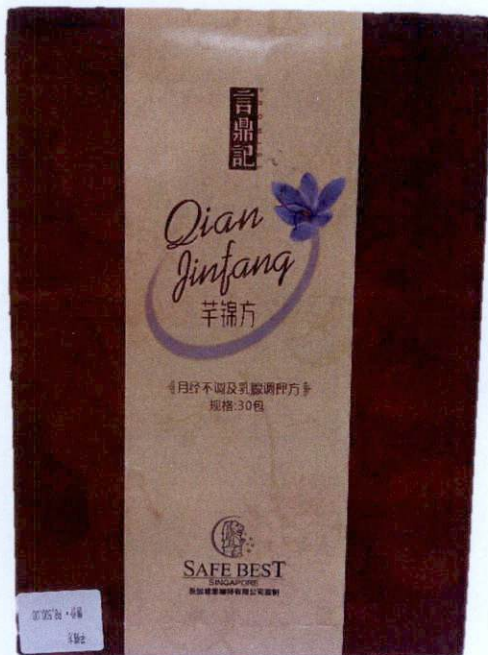
Figure 4. Unregistered SAFE BEST Qian Jinfang (in a Maroon colored carton box) (Labels are in foreign characters)