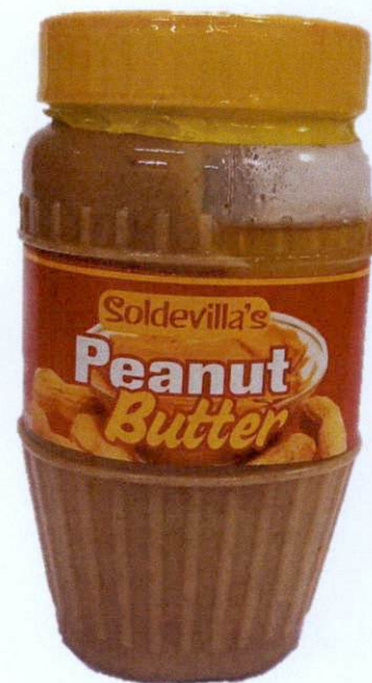
Figure 5. Unregistered SOLDEVILLA'S Peanut Butter