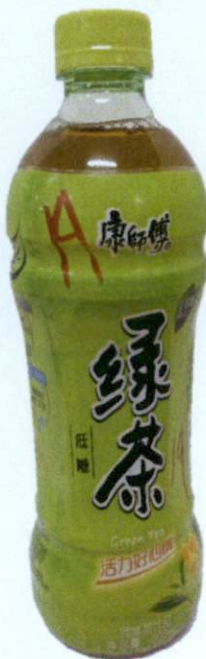
Figure 1. . Unregistered Green Tea in a clear Plastic Bottle with Green colored label ( Labels are in foreign characters )

The Food and Drug Administration (FDA) warns all healthcare professionals and the general public NOT TO PURCHASE AND CONSUME the following unregistered food products: