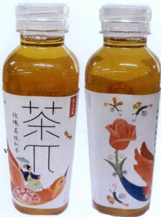
Figure 4. Unregistered Beverage in a clear Plastic Bottle with Bird and Rose artworks on White label (Labels are in foreign characters)