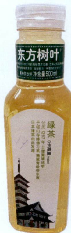
Figure 5. Unregistered Yellow colored Beverage in a clear Plastic Bottle with Green and White colored Label (Labels are in foreign characters)