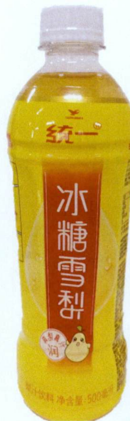
Figure 3. Unregistered Beverage in a Plastic Bottle with Yellow colored Label and Pear artwork (Labels are in foreign characters)