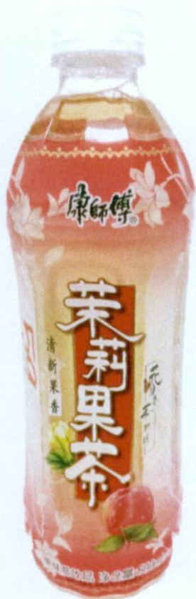
Figure 2. Unregistered Beverage in a Plastic Bottle with Pink and Gold Colored Label and Peach artwork (Labels are in foreign characters)