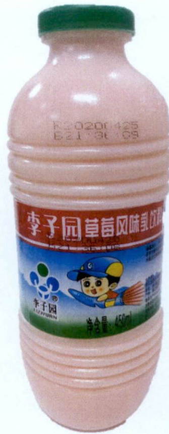
Figure 3. Unregistered Pink colored Beverage in a White plastic bottle (Pink and Blue colored label with a Boy artwork) (Labels are in foreign characters)