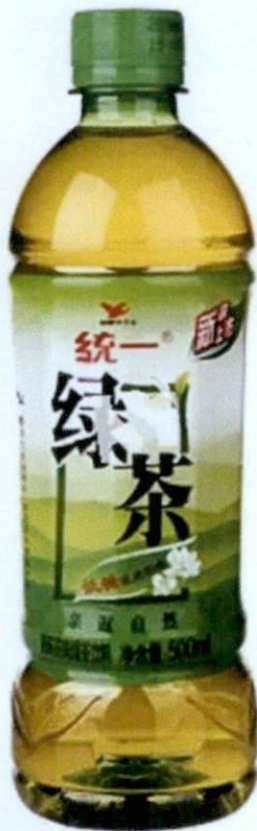
Figure 4. Unregistered Beverage in a clear plastic bottle with Green and White colored label and Green colored lid (Labels are in foreign characters)