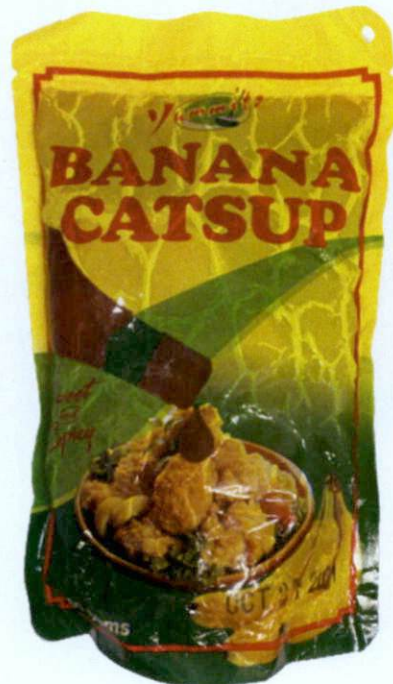
Figure 1. Unregistered YUMMITO Banana Catsup Sweet & Spicy, 200 g

The Food and Drug Administration (FDA) warns all healthcare professionals and the general public NOT TO PURCHASE AND CONSUME the following unregistered food products: