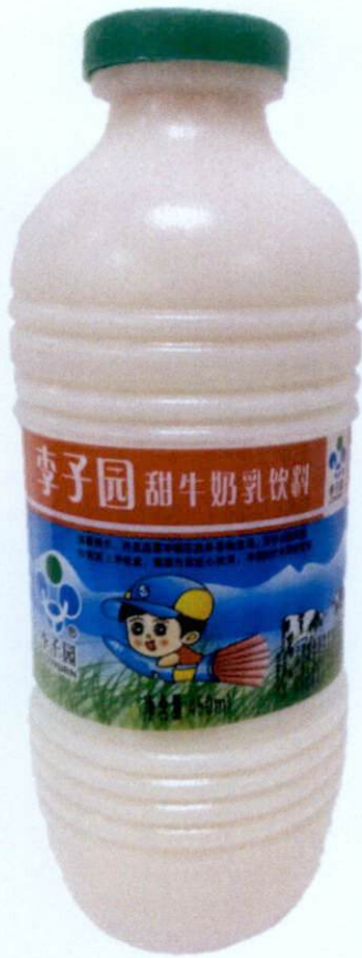
Figure 2. Unregistered White Beverage in a White plastic bottle (Red and Blue colored label with a Boy and Cow artworks) (Labels are in foreign characters)