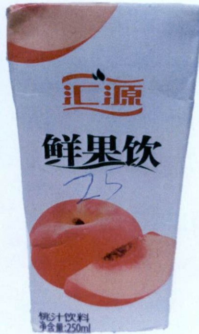
Figure 3. Unregistered Beverage in a White tetra pack with Peach artwork (Labels are in foreign characters)