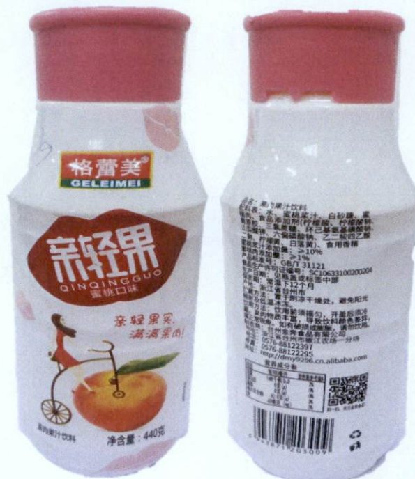
Figure 1. Unregistered GELEIMEI Qinqingguo (in a plastic bottle with Red and White Colored label with Orange artwork) and Pink colored lid (Labels are in foreign characters)

The Food and Drug Administration (FDA) warns all healthcare professionals and the general public NOT TO PURCHASE AND CONSUME the following unregistered food products: