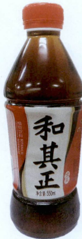
Figure 5. Unregistered Botanical Beverage (in a clear plastic bottle with Red and White colored label and Red colored lid) (Labels are in foreign characters)