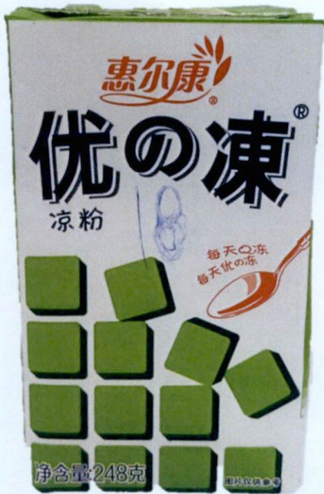
Figure 2. Unregistered Beverage in a Green and White colored tetra pack with Green Cubes artwork (Labels are in foreign characters)