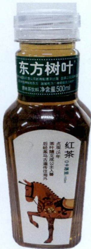
Figure 4. Unregistered Brown colored Beverage in a clear plastic bottle with Horse artwork on the label (Labels are in foreign characters)