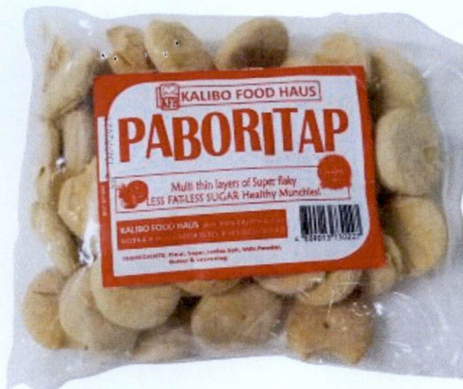
Figure 2. Unregistered KALIBO FOOD HAUS Paboritap