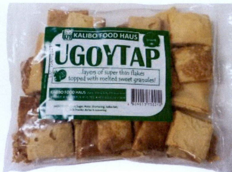
Figure 1. Unregistered KALIBO FOOD HAUS Ugoytap

The Food and Drug Administration (FDA) warns all healthcare professionals and the general public NOT TO PURCHASE AND CONSUME the following unregistered food products: