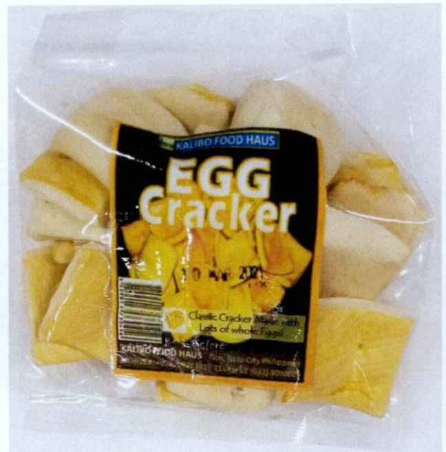
Figure 3. Unregistered KALIBO FOOD HAUS Egg Cracker