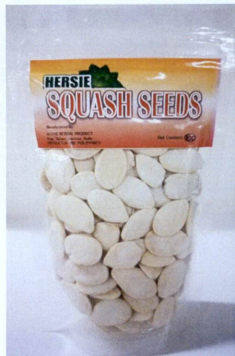
Figure 5. Unregistered HERSIE Squash Seeds