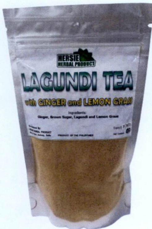
Figure 4. Unregistered HERSIE HERBAL PRODUCT Lagundi Tea with Ginger and Lemon Grass