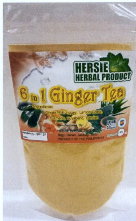
Figure 1. Unregistered HERSIE HERBAL PRODUCT 6 in 1 Ginger Tea

The Food and Drug Administration (FDA) warns all healthcare professionals and the general public NOT TO PURCHASE AND CONSUME the following unregistered food products: