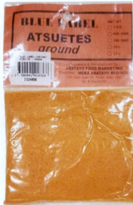
Figure 3. Unregistered BLUE LABEL Atsuetes Ground