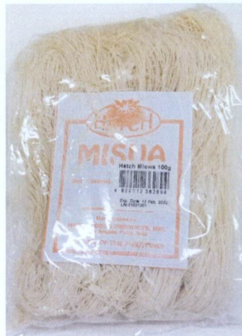
Figure 5. Unregistered HATCH Misua