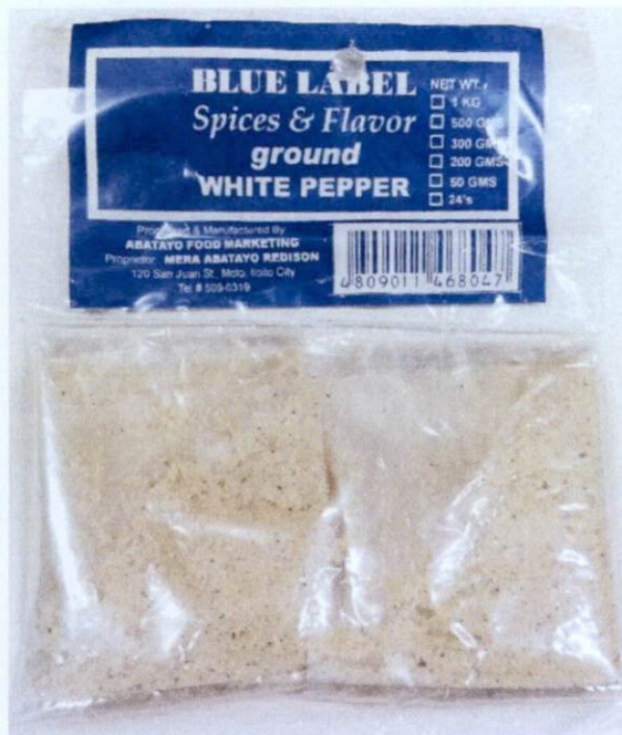
Figure 4. Unregistered BLUE LABEL Spices & Flavor Ground White Pepper