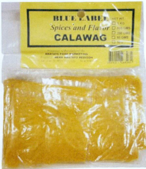
Figure 2. Unregistered BLUE LABEL Spices & Flavor Calawag