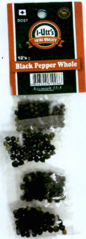
Figure 2. Unregistered I-UTT'S Black Pepper Whole