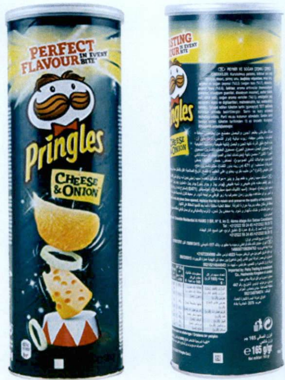
Figure 3. Unregistered PRINGLES Cheese and Onion (In Foreign Label)