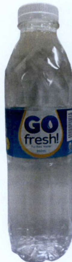
Figure 5. Unregistered GO FRESH Purified Water