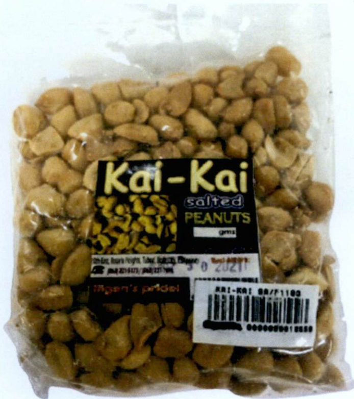
Figure 4. Unregistered KAI-KAI Salted Peanuts