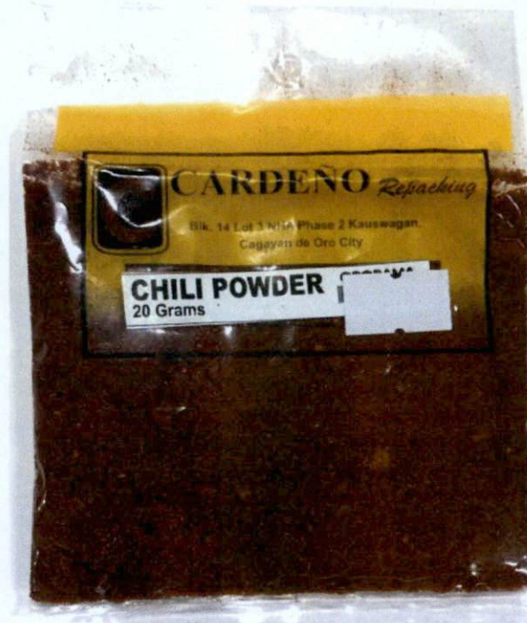
Figure 1. Unregistered CARDEÑO REPACKING Chili Powder

The Food and Drug Administration (FDA) warns all healthcare professionals and the general public NOT TO PURCHASE AND CONSUME the following unregistered food products: