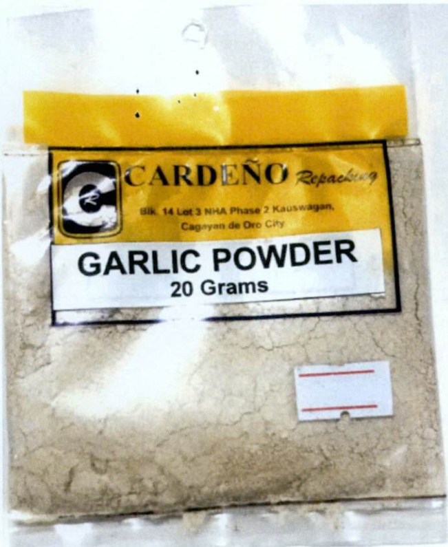
Figure 2. Unregistered CARDEÑO REPACKING Garlic Powder