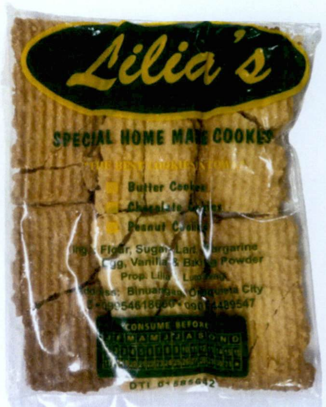
Figure 5. Unregistered LILIA' SPECIAL HOMEMADE Cookies