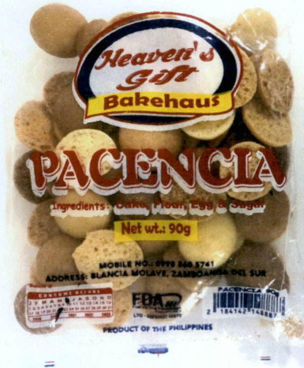
Figure 4. Unregistered HEAVEN'S GIFT BAKEHAUS Pacencia