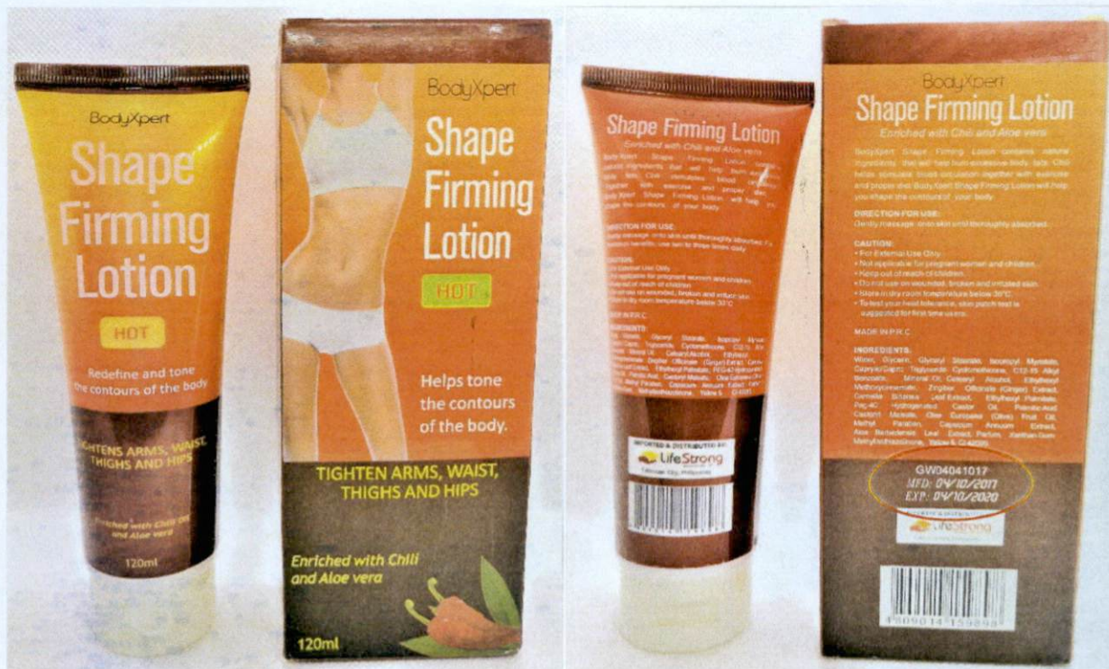
Figure 1. Counterfeit BODYXPert SHAPE FIRMING LOTION

In furtherance to FDA Advisory No. 2021-0581 "Public Health Warning Against the Purchase and Use of the Non-Compliant Cosmetic Product "BODYXPert SHAPE FIRMING LOTION" dated 12 March 2021, the Food and Drug Administration (FDA) reiterates its advice to the public against the purchase and use of the cosmetic product, BODYXPert SHAPE FIRMING LOTION. (Refer to image below)