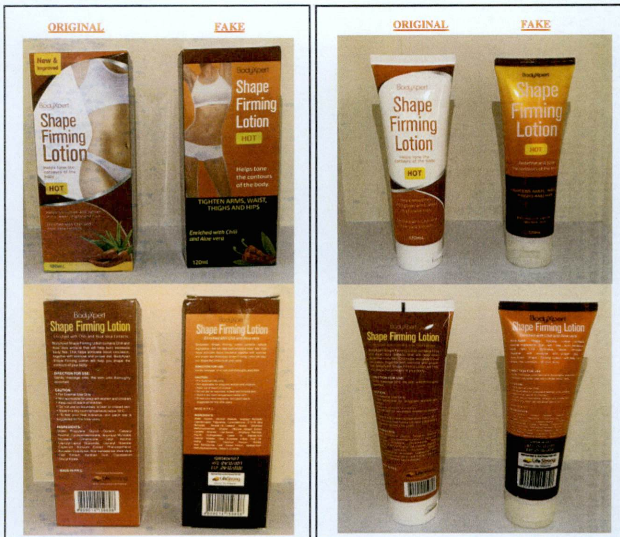
Figure 2. Comparison of the Authentic vs. the Counterfeit product

Counterfeit products did not go through the required safety assessment and the FDA verification process. These products pose potential health hazards to the consuming public since their safety and purity cannot be guaranteed. Potential hazards may come from ingredients that are not allowed to be part of a cosmetic product or restricted ingredients that in excessive amount as per ASEAN Cosmetic Directive (ACD). The use of substandard and possibly adulterated cosmetic products may result to adverse reactions, including but not limited to, skin irritation, itchiness, anaphylactic shock, and organ failure.