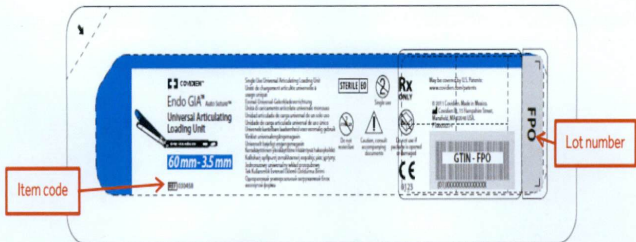
Figure 3. Photo of Affected Covidien Endo GIA™ Auto Suture™ Universal Articulating Loading Units, 60mm-3.5mm

Medtronic Philippines Inc. initiated the voluntary recall of the above-mentioned specific lots/batches of Covidien Endo GIA™ Auto Suture™ universal articulating loading units in response to one confirmed customer report that the device staples were not properly formed upon application preventing adequate hemostasis. Investigation has shown this is due to manufacturing assembly error that can contribute to staple malformation.