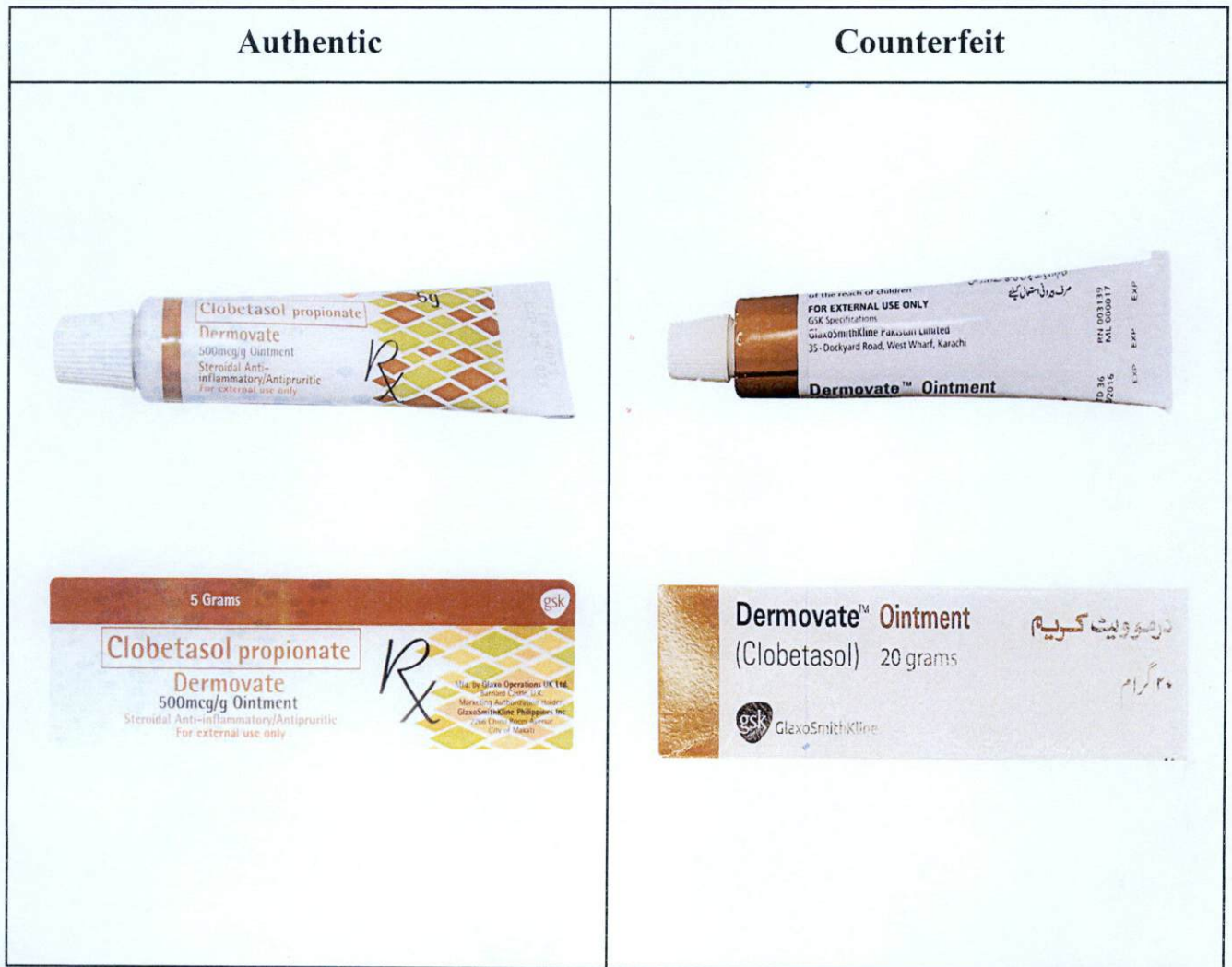
Figure 1. Comparison between the Authentic and Verified Counterfeit Dermovate™ Ointment (Clobetasol)

The Food and Drug Administration (FDA) advises the public against the purchase and use of the counterfeit Dermovate™ Ointment (Clobetasol) 20 grams: