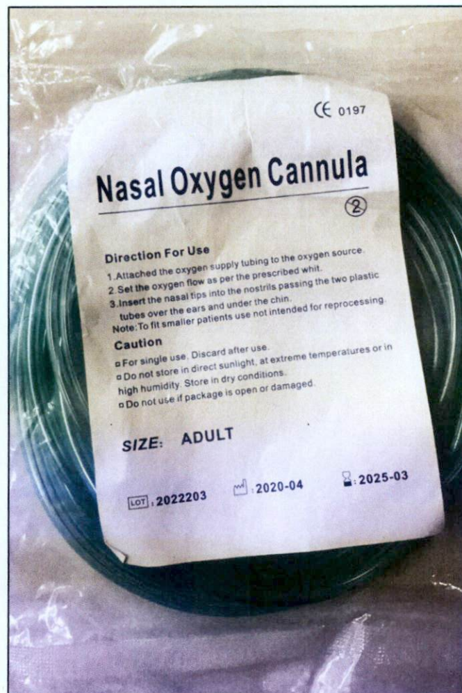
Figure 1. Unregistered Nasal Oxygen Cannula (Size: Adult)

The Food and Drug Administration (FDA) warns all healthcare professionals and the general public NOT TO PURCHASE AND USE the unregistered medical device product: