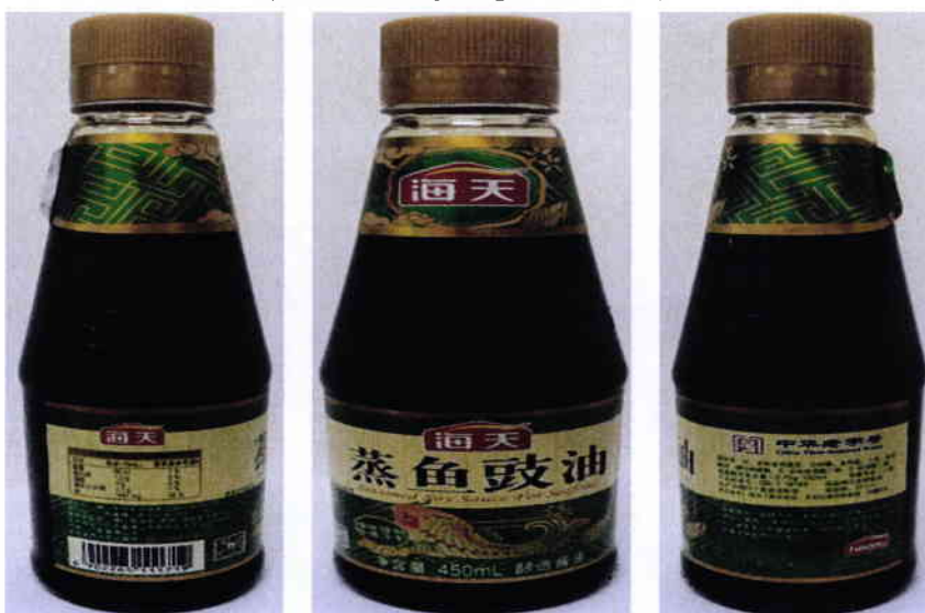
Figure 4. Unregistered CHINA TIME-HONORED BRAND Seasoned Soy Sauce for Seafood, 450ml (Labels are in foreign Characters)