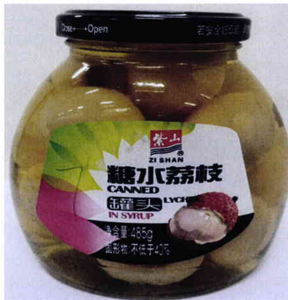
Figure 1. Unregistered ZI SHAN Canned Lychee in Syrup, 485g (Labels are in foreign Characters)

The Food and Drug Administration (FDA) warns all healthcare professionals and the general public NOT TO PURCHASE AND CONSUME the following unregistered food products: