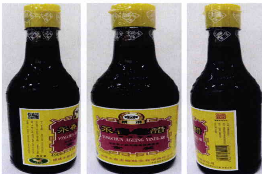
Figure 3. Unregistered TAO XI Yongchun Ageing Vinegar, 490ml (Labels are in foreign Characters)