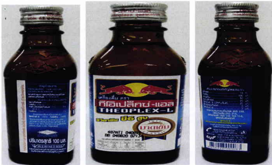
Figure 2. Unregistered THEOPLEX-L (drink with images of bull) (Labels are in foreign Characters)