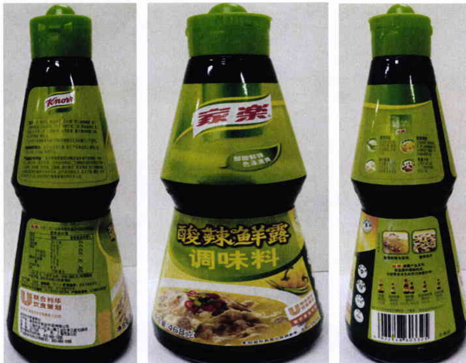
Figure 5. Unregistered KNORR Liquid Seasoning (In Green Bottled container) (Labels are in foreign Characters)

The FDA verified through online monitoring or post-marketing surveillance that the abovementioned food products are not registered and no corresponding Certificates of Product Registration (CPR) have been issued. Pursuant to the Republic Act No. 9711, otherwise known as the “Food and Drug Administration Act of 2009”, the manufacture, importation, exportation, sale, offering for sale, distribution, transfer, non-consumer use, promotion, advertising or sponsorship of health products without the proper authorization is prohibited.