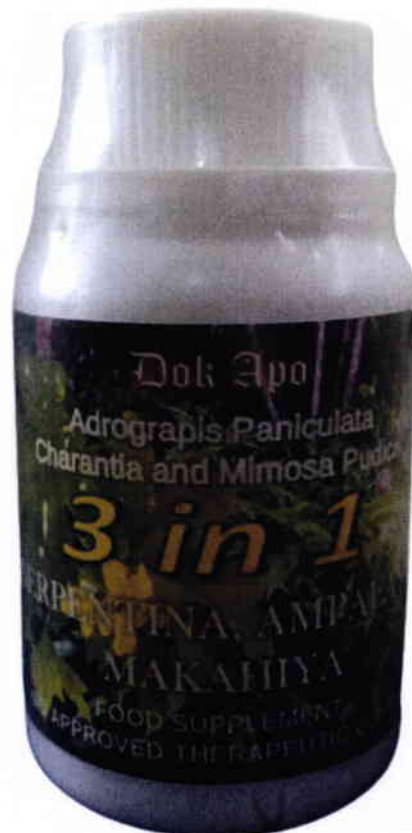
Figure 1. Unregistered DOK APO Serpentina, Ampalaya, Makahiya Food Supplement

The Food and Drug Administration (FDA) warns all healthcare professionals and the general public NOT TO PURCHASE AND CONSUME the following unregistered food supplements: