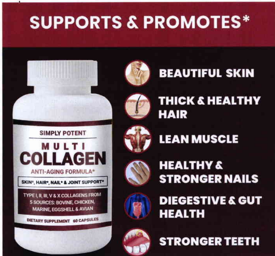
Figure 2. Unregistered SIMPLY POTENT Multi Collagen Dietary Supplement