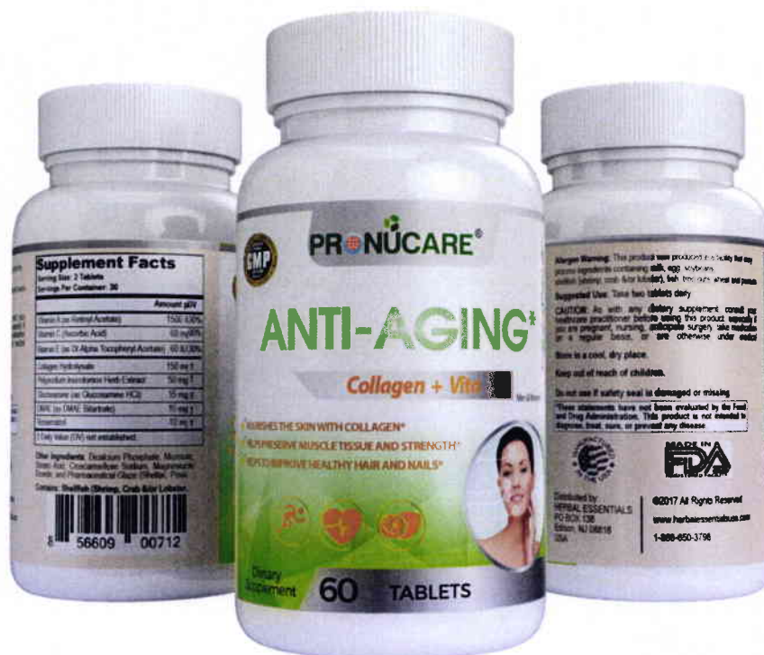
Figure 3. Unregistered PRONUCARE Anti-aging Collagen + Vita Dietary Supplements