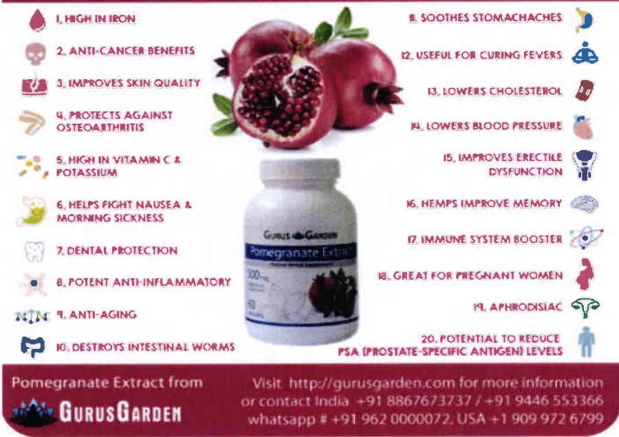
Figure 2. Unregistered GURUS GARDEN Pomegranate Extract Food Supplement