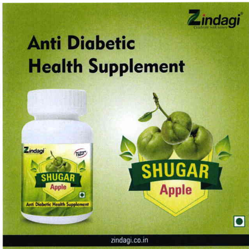
Figure 4. Unregistered ZINDAGI Shugar Apple Anti Diabetic Health Supplement

The FDA verified through online monitoring or post-marketing surveillance that the abovementioned food supplements are not registered and no corresponding Certificates of Product Registration (CPR) have been issued. Pursuant to the Republic Act No. 9711, otherwise known as the “Food and Drug Administration Act of 2009”, the manufacture, importation, exportation, sale, offering for sale, distribution, transfer, non-consumer use, promotion, advertising or sponsorship of health products without the proper authorization is prohibited.