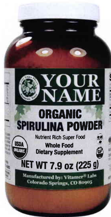
Figure 3. Unregistered YOUR NAME Organic Spirulina Powder Whole Food Dietary Supplement