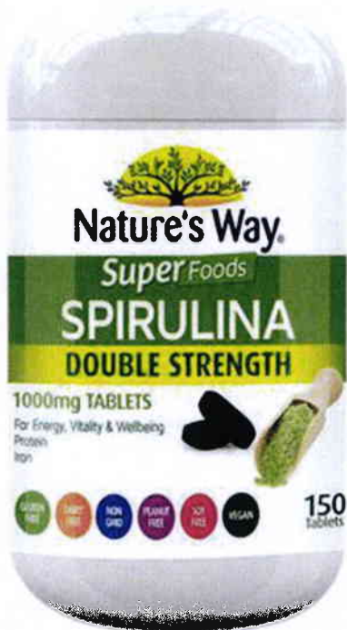
Figure 2. Unregistered NATURE'S WAY SUPERFOODS Spirulina Double Strength Dietary Supplement