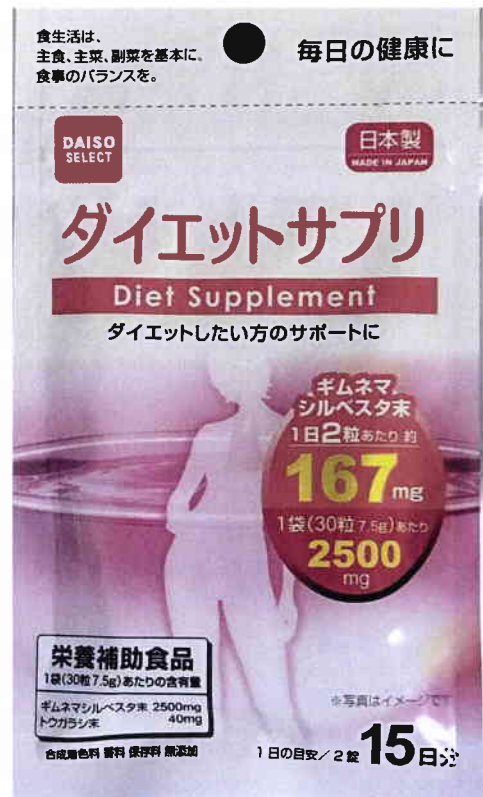
Figure 5. Unregistered DAISO SELECT Supplement