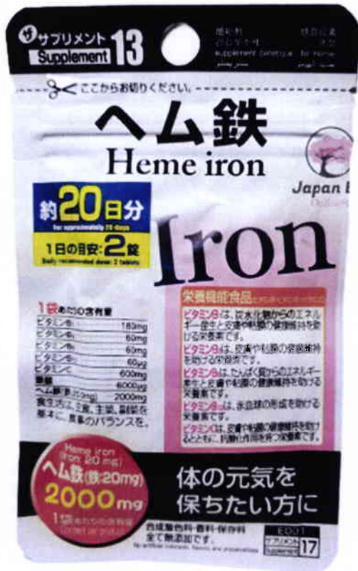
Figure 4. Unregistered UNBRANDED Heme Iron (In Foreign Language)