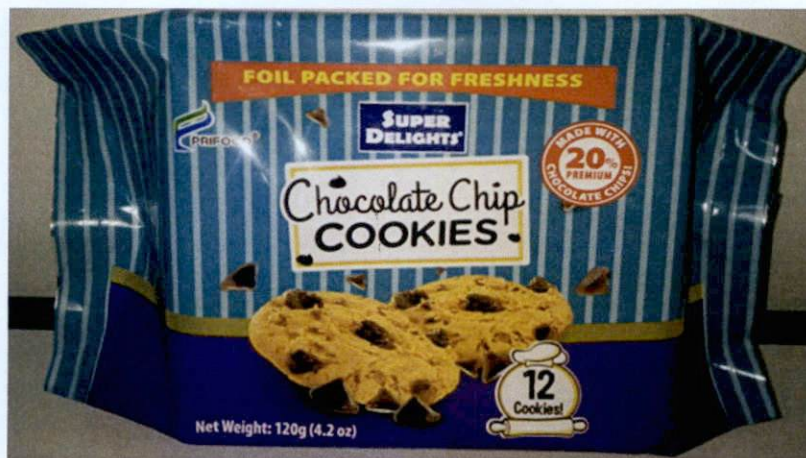
Figure 4. Approved label of PRIFOOD SUPER DELIGHTS Chocolate Chip Cookies under FR-4000004495163 valid until 07 October 2024