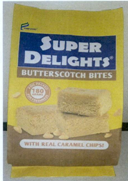
Figure 2. Approved label of PRIFOOD SUPER DELIGHTS Butterscotch Bites with Real Caramel Chips under FR- 4000004692173 valid until 24 September 2024