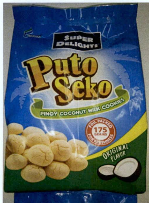
Figure 1. Approved label of PRIFOOD SUPER DELIGHTS Puto Seko Pinoy Coconut Milk Cookies Original Flavor under FR-4000005519767 valid until 21 February 2025

The Food and Drug Administration (FDA) informs the public that the following food products of PRIFOOD SUPER DELIGHTS have been registered by the Market Authorization Holder PRIFOOD CORPORATION in accordance to existing FDA rules and regulations.