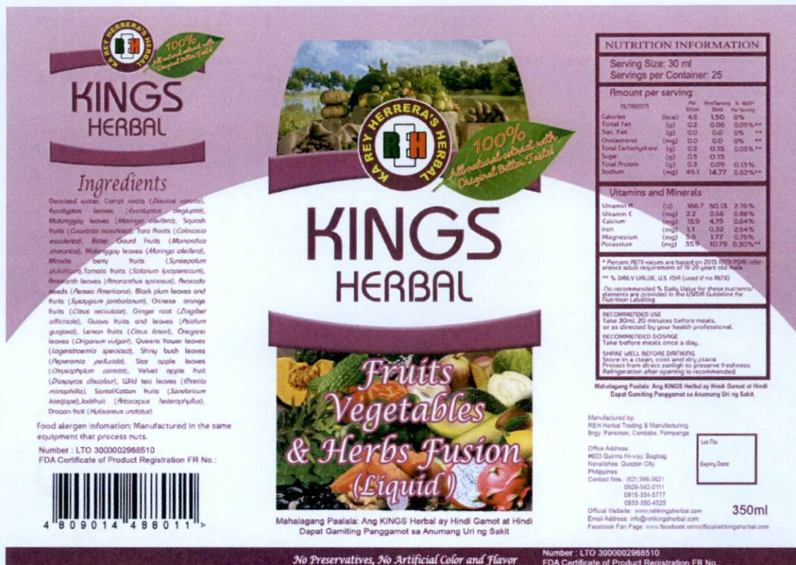
Figure 1. Approved label of KINGS HERBAL Fruits, Vegetable and Herbal Fusion Food Supplement under FR-4000004596417 valid until 23 October 2024

The Food and Drug Administration (FDA) informs the public that the food product KINGS HERBAL Fruits, Vegetable and Herbal Fusion Food Supplement has complied with prevailing regulations against advertisements related to COVID-19.