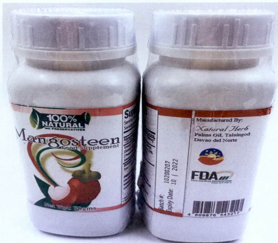
Figure 3. Unregistered (UNBRANDED) Mangosteen Food Supplement, Net Wt. 50gms.