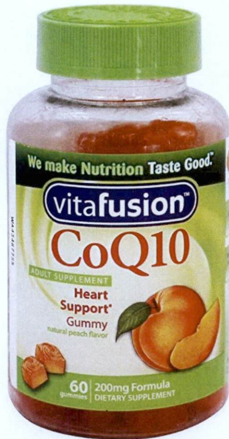
Figure 2. Unregistered VITAFUSION CoQ10 Adult Supplement –Natural Peach Flavor 200mg Formula Dietary Supplement, 60 Gummies