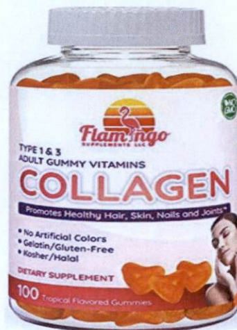
Figure 1. Unregistered FLAMINGO Collagen Type 1&3 Adult Gummy Vitamins Dietary Supplement, 100 Tropical Flavoured Gummies

The Food and Drug Administration (FDA) warns all healthcare professionals and the general public NOT TO PURCHASE AND CONSUME the following unregistered food supplements: