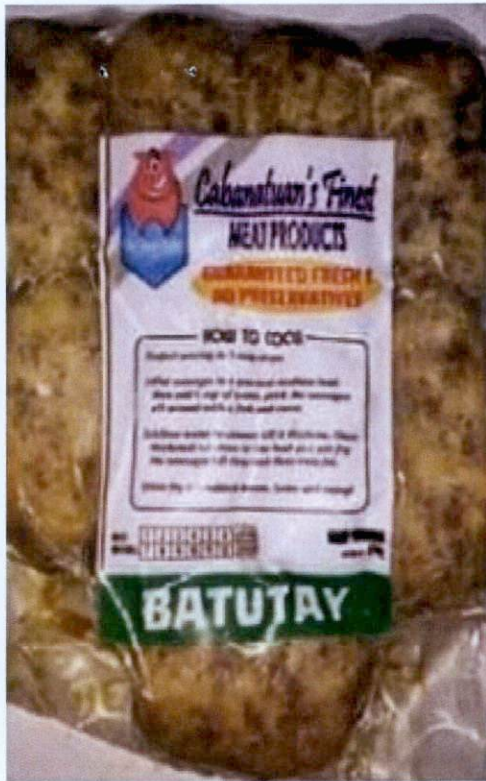
Figure 2. Unregistered CABANATUAN'S FINEST MEAT PRODUCTS Batutay, 450g