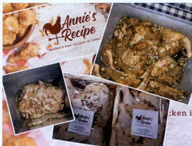
Figure 1. Unregistered ANNIE'S RECIPE Mother's Best Chicken in Town

The Food and Drug Administration (FDA) warns all healthcare professionals and the general public NOT TO PURCHASE AND CONSUME the following unregistered food products and food supplements: