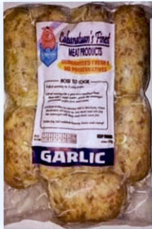
Figure 3. Unregistered CABANATUAN'S FINEST MEAT PRODUCTS Garlic, 450g