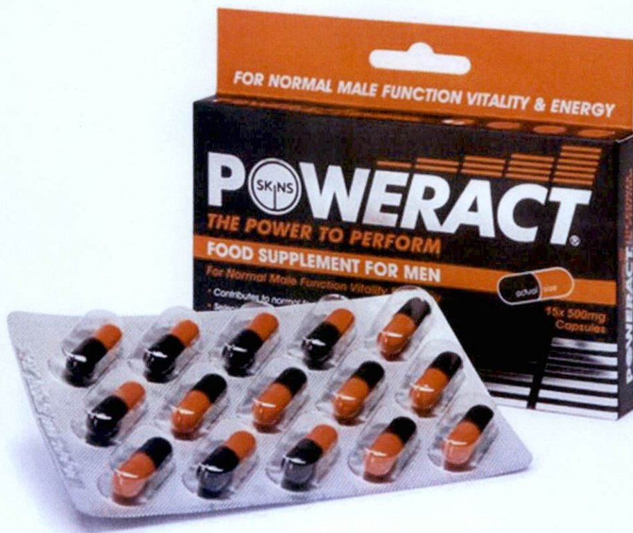
Figure 4. Unregistered SKINS POWERACT The Power to Perform Food Supplement for Men, 15x500mg Capsules