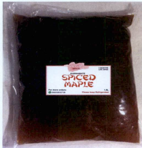
Figure 1. Unregistered M&M's MERCHANDISE KUSINAMATE Spiced Maple, 1.5L

The Food and Drug Administration (FDA) warns all healthcare professionals and the general public NOT TO PURCHASE AND CONSUME the following unregistered food products: