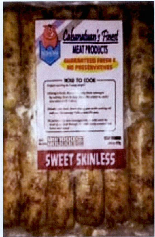
Figure 3. Unregistered CABANATUAN'S FINEST MEAT PRODUCTS Sweet Skinless, 450g