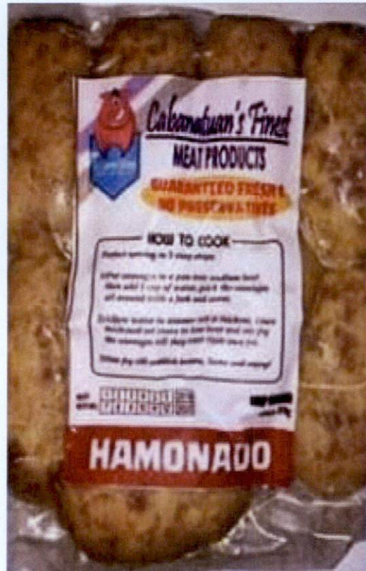
Figure 5. Unregistered CABANATUAN'S FINEST MEAT PRODUCTS Hamonado, 450g