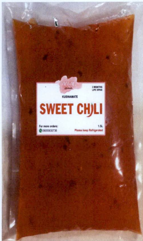
Figure 2. Unregistered M&M's MERCHANDISE KUSINAMATE Sweet Chili, 1.5L