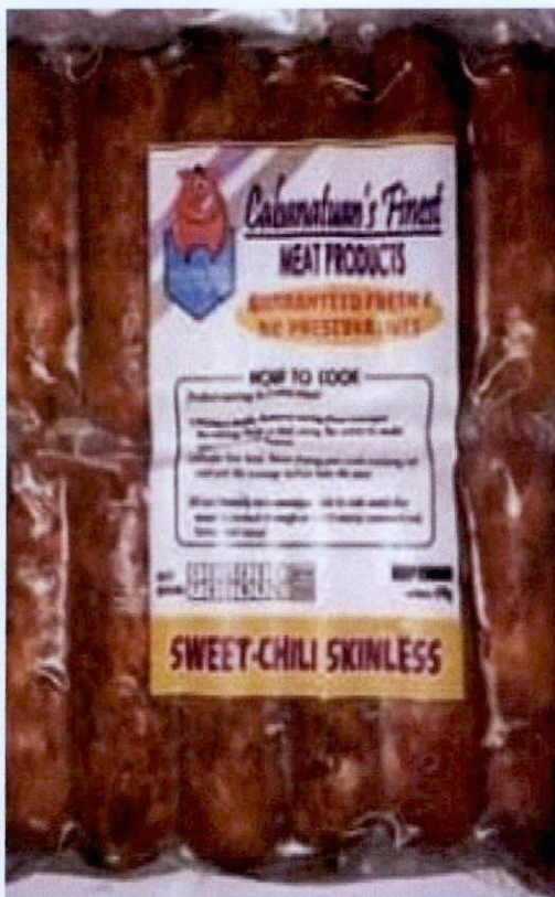
Figure 4. Unregistered CABANATUAN'S FINEST MEAT PRODUCTS Sweet Chili Skinless, 450g