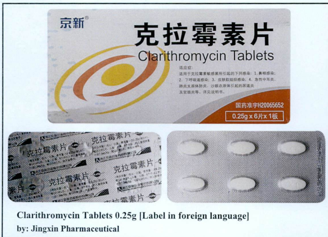
Clarithromycin Tablets 0.25g [Label in foreign language] by: Jingxin Pharmaceutical

The Food and Drug Administration (FDA) advises the public against the purchase and use of the following unregistered drug products: