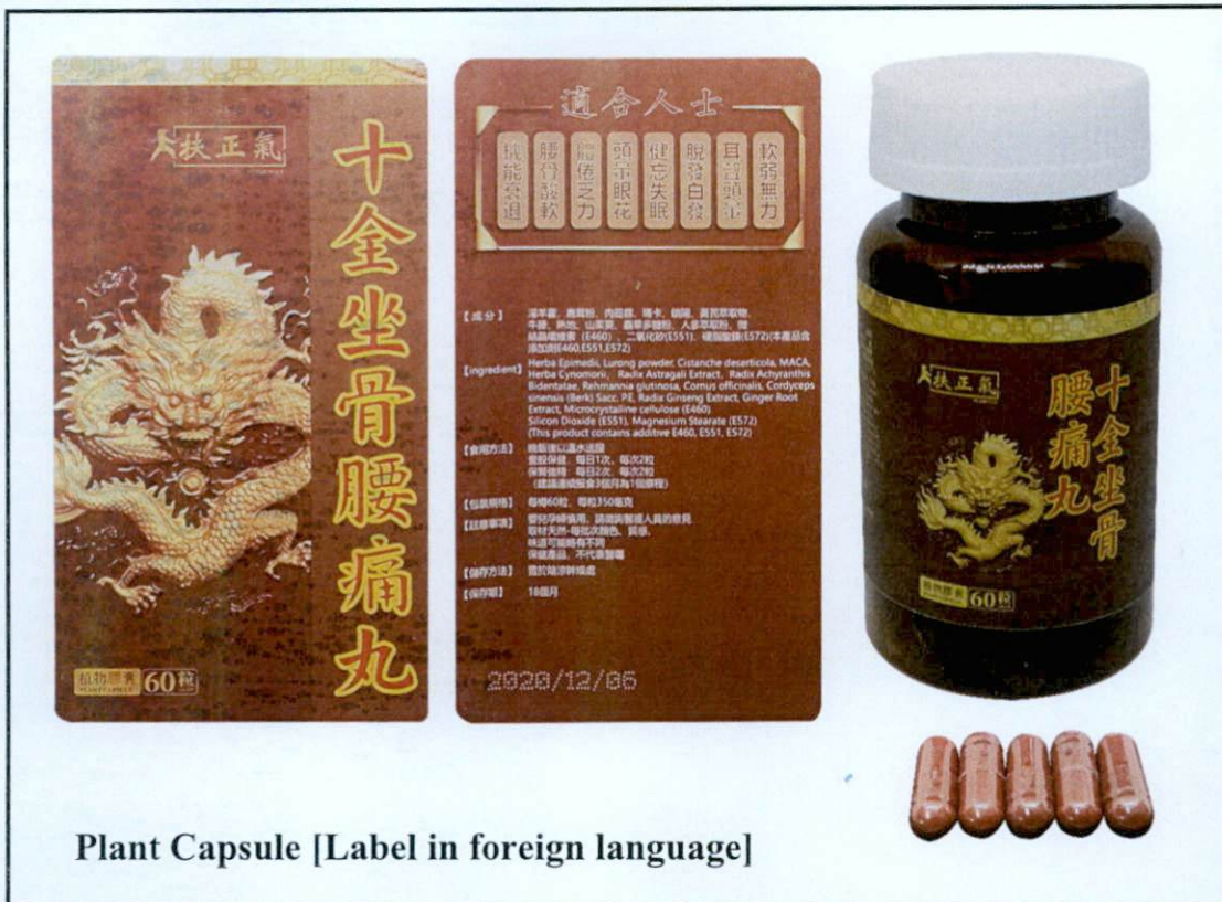
Plant Capsule [Label in foreign language]