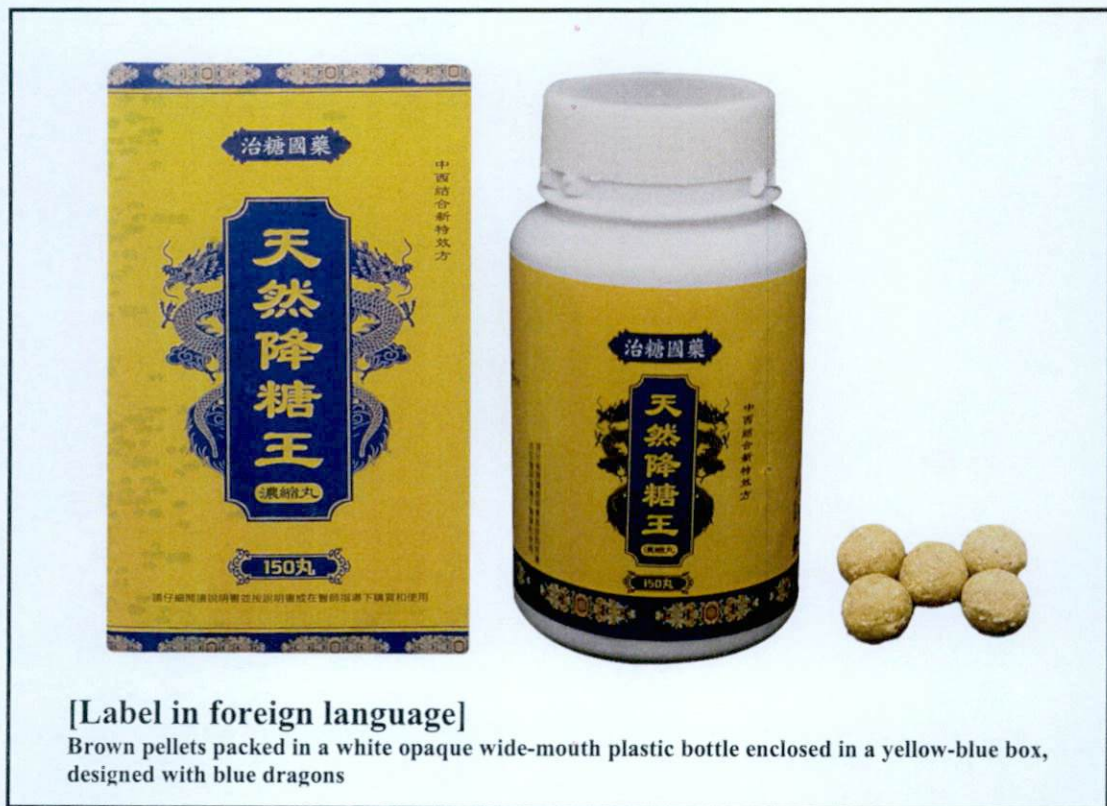
[Label in foreign language]