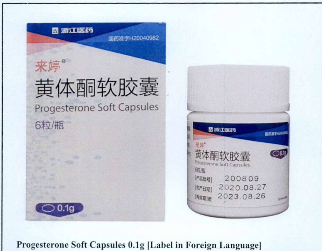
Progesterone Soft Capsules 0.1g [Label in Foreign Language]

The Food and Drug Administration (FDA) advises the public against the purchase and use of the following unregistered drug products: