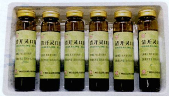
OTC Qingkailing Koufuye