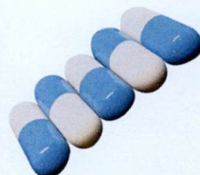
New Quick Rheumatism Capsule Tiger Wang Biaod 20caps by: Hong Pin Medicine (HK) Corporation