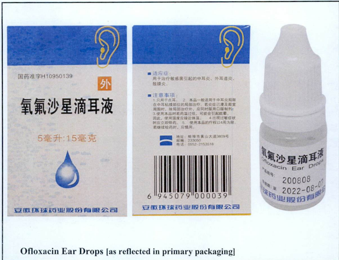
Figure 4. Unregistered drug product