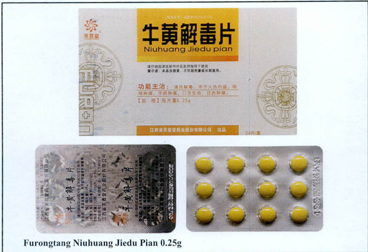
Furongtang Niu Huang Jiedu Pian 0.25g