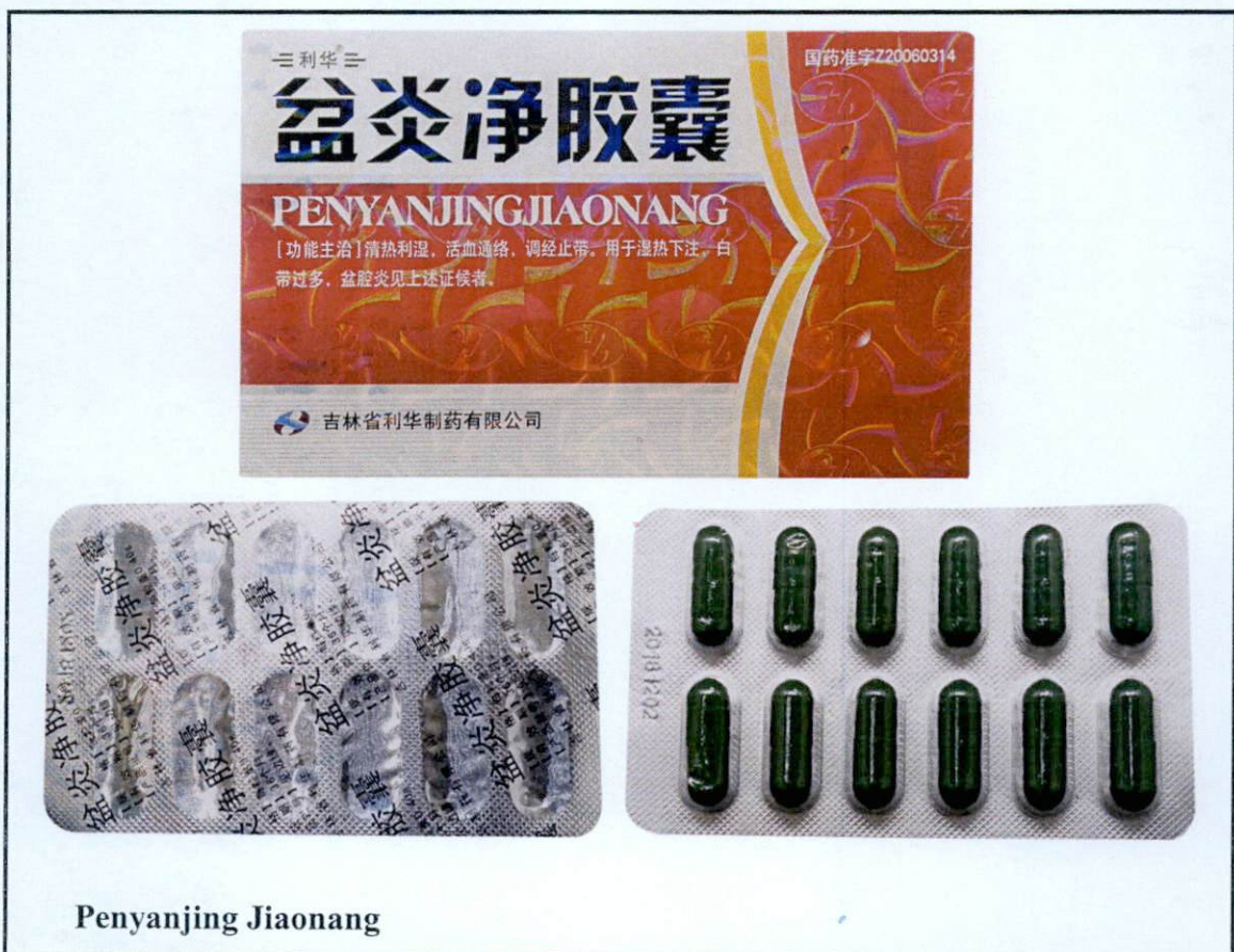
Figure 5. Unregistered drug product