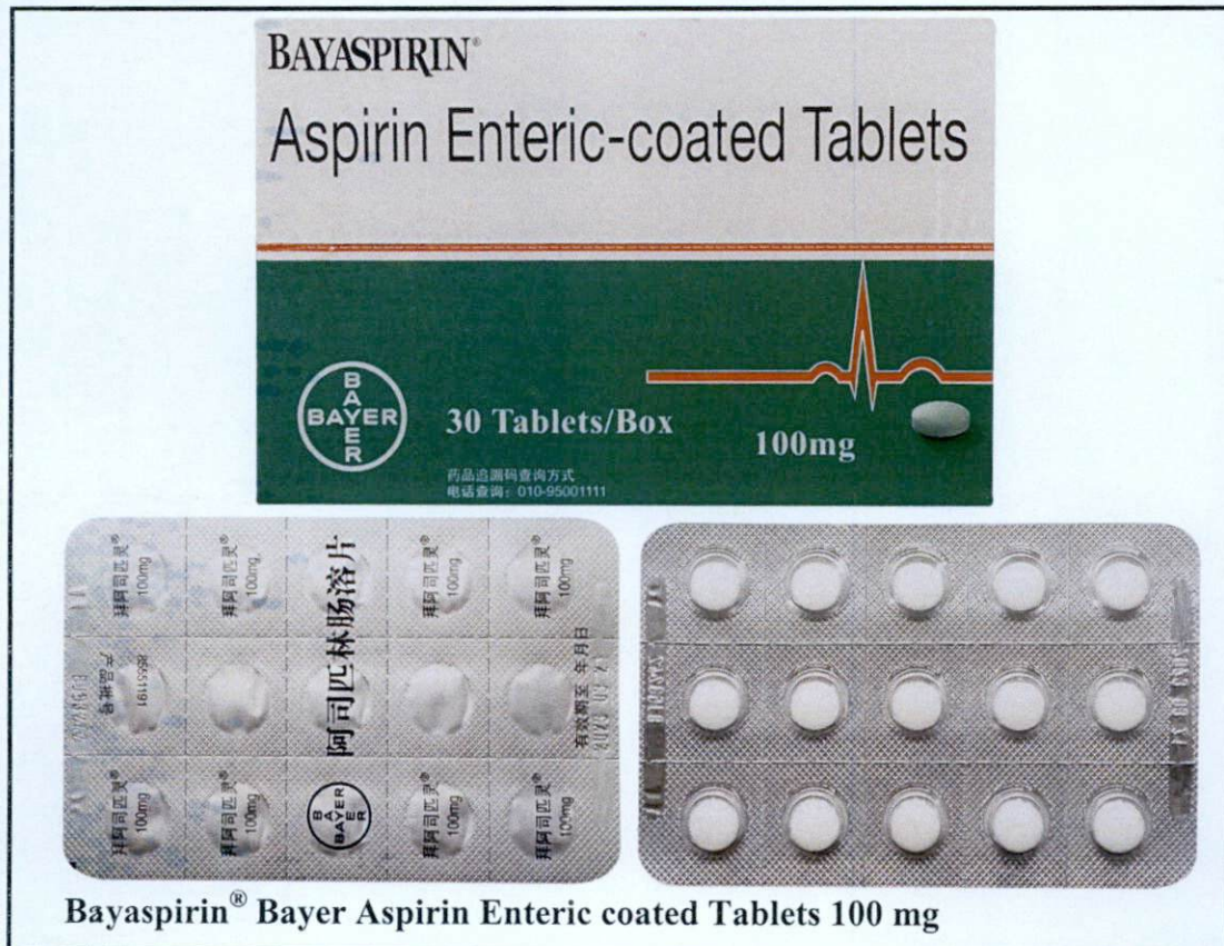
Bayaspirin® Bayer Aspirin Enteric coated Tablets 100 mg

The Food and Drug Administration (FDA) advises the public against the purchase and use of the following unregistered drug products: