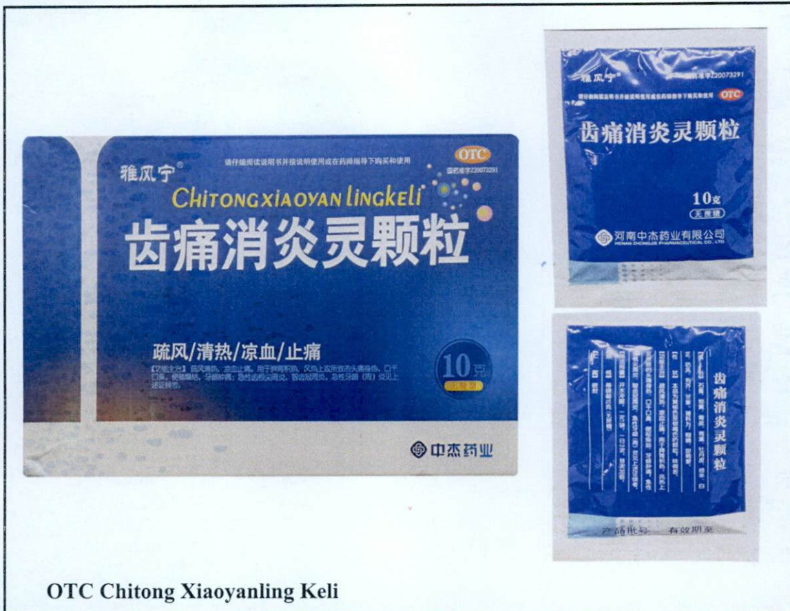
OTC Chitong Xiaoyanling Keli