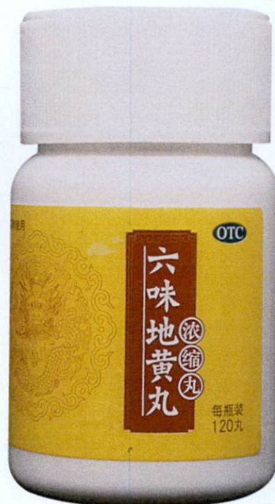
OTC Liuwei Dihuang Wan [as reflected in the package insert] by: Beijing Tong Ren Tang