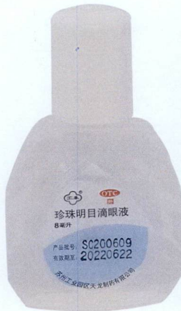
OTC Zhenzhu Mingmu Diyanye 8ml [as reflected in the package insert] by: Suzhoutianlong