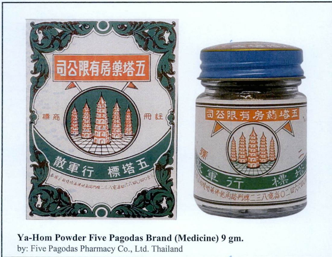
Ya-Hom Powder Five Pagodas Brand (Medicine) 9 gm.

The Food and Drug Administration (FDA) advises the public against the purchase and use of the following unregistered drug products: