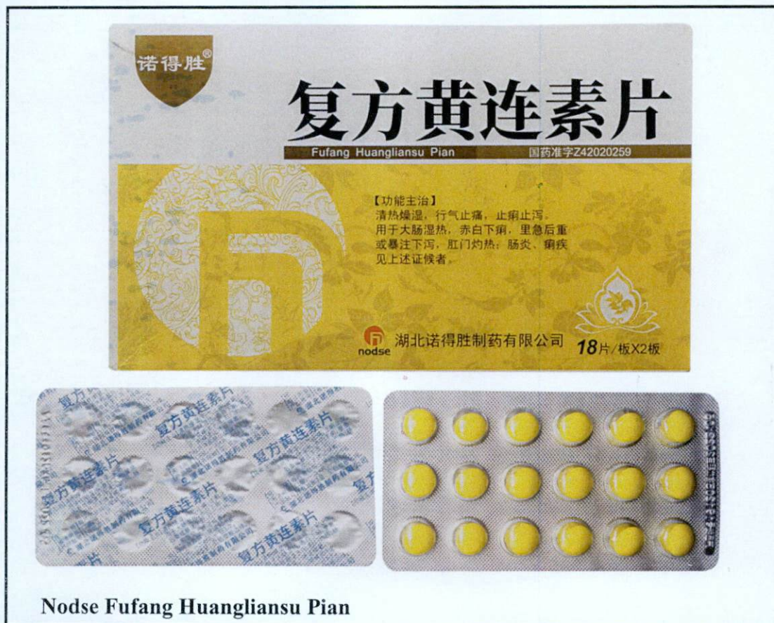
Nodse Fufang Huangliansu Pian

The Food and Drug Administration (FDA) advises the public against the purchase and use of the following unregistered drug products: