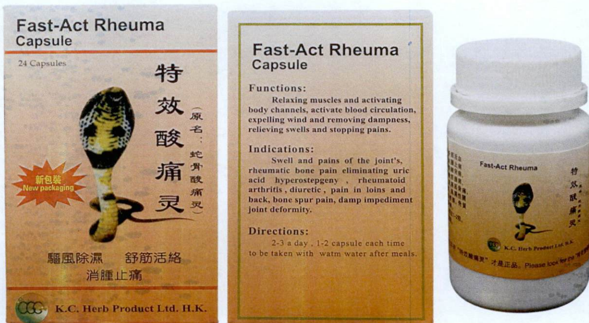
Fast-Act Rheuma Capsule 24's by: K.C Herb Product Ltd. H.K