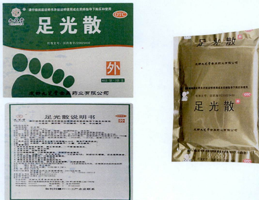
OTC Zuguang San