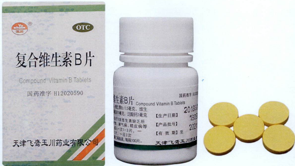
OTC Yu Chuon Compound Vitamin B Tablets