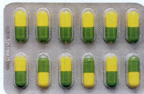
CSPC® Amoxicillin Capsules 0.25g [Label in Foreign Language]