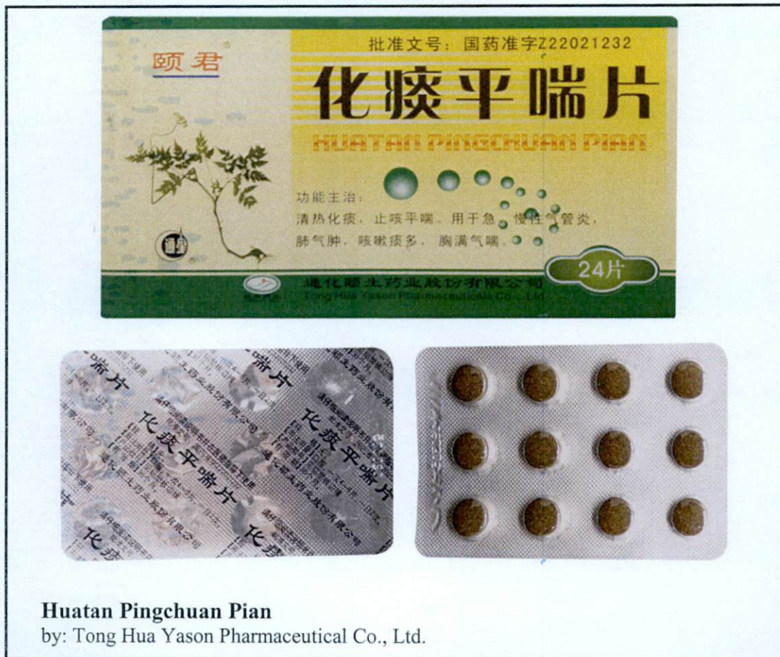
Huatan Pingchuan Pian by: Tong Hua Yason Pharmaceutical Co., Ltd.

The Food and Drug Administration (FDA) advises the public against the purchase and use of the following unregistered drug products: