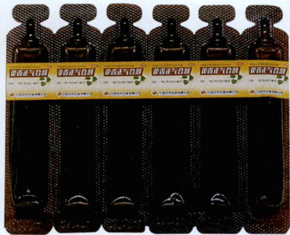
OTC Jiangxi Minji Huoxiang Zhengqi Heji by: Jiangxi Minji Medicine Co., Ltd