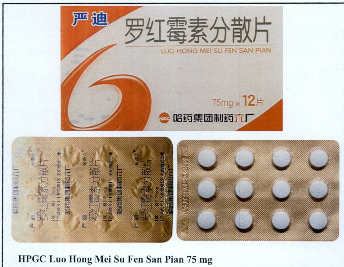
Larawan 1. Hindi rehiistradong gamot

Pinapayuhan ng Food and Drug Administration (FDA) ang publiko laban sa pagbili at paggamit ng mga sumusunod na hindi rehiistradong gamot: