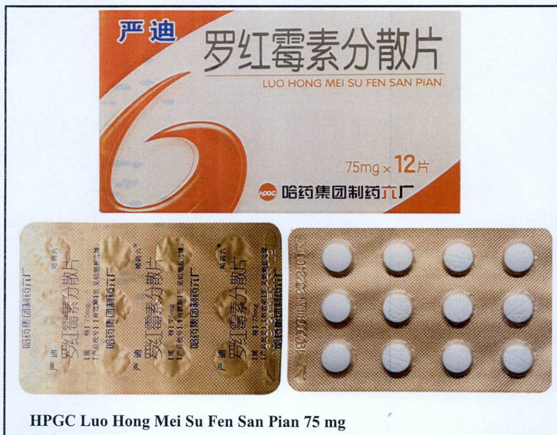
HPGC Luo Hong Mei Su Fen San Pian 75 mg

The Food and Drug Administration (FDA) advises the public against the purchase and use of the following unregistered drug products: