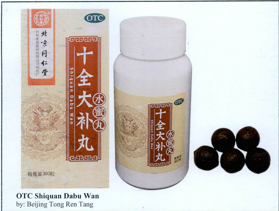
OTC Shiquan Dabu Wan by: Beijing Tong Ren Tang