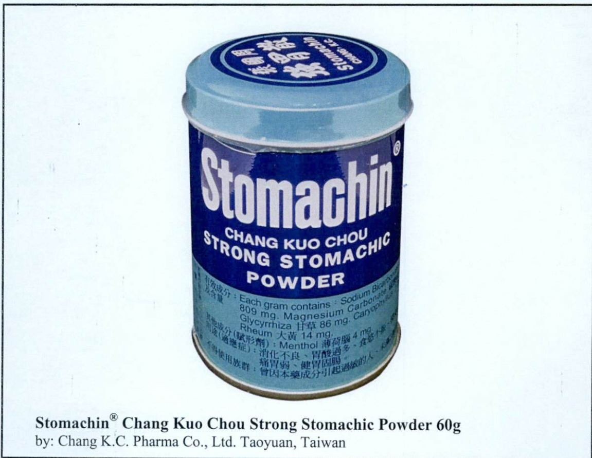
Stomachin® Chang Kuo Chou Strong Stomachic Powder 60g by: Chang K.C. Pharma Co., Ltd. Taoyuan, Taiwan