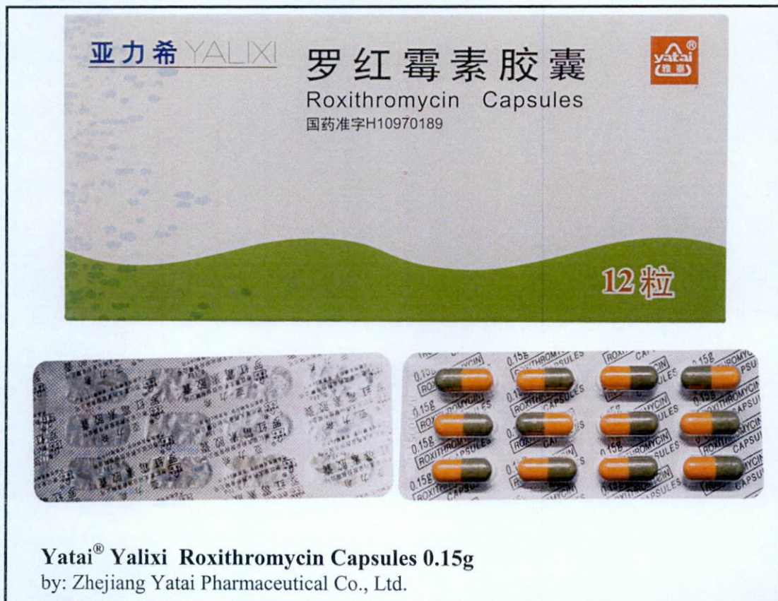
Yatai® Yalixi Roxithromycin Capsules 0.15g by: Zhejiang Yatai Pharmaceutical Co., Ltd.

The Food and Drug Administration (FDA) advises the public against the purchase and use of the following unregistered drug products: