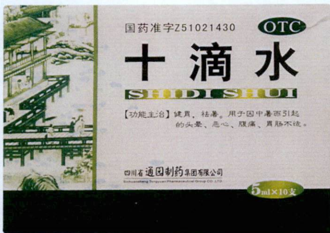
Figure 2. Unregistered drug product