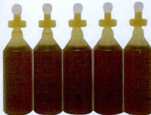
OTC Shidi Shui 5ml by: Sichuan Sheng Tongyuan Pharmaceutical Group Co., Ltd.