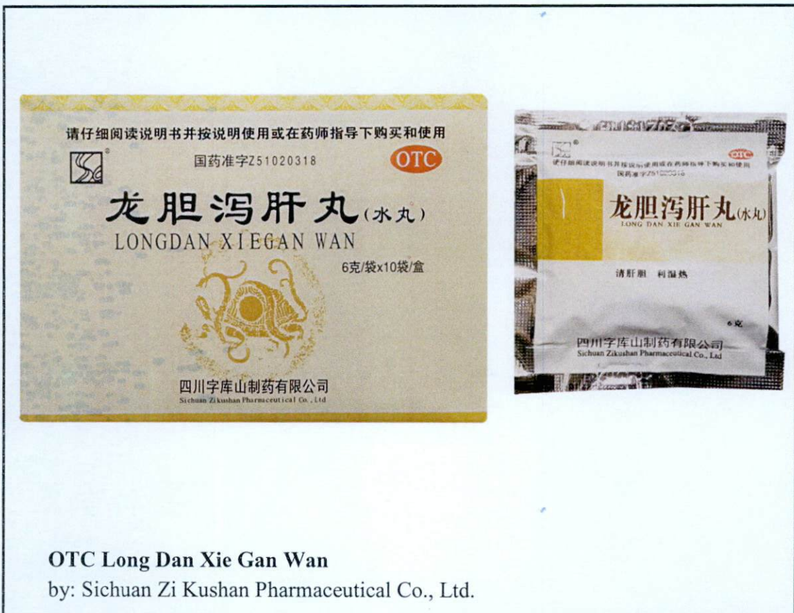
OTC Long Dan Xie Gan Wan